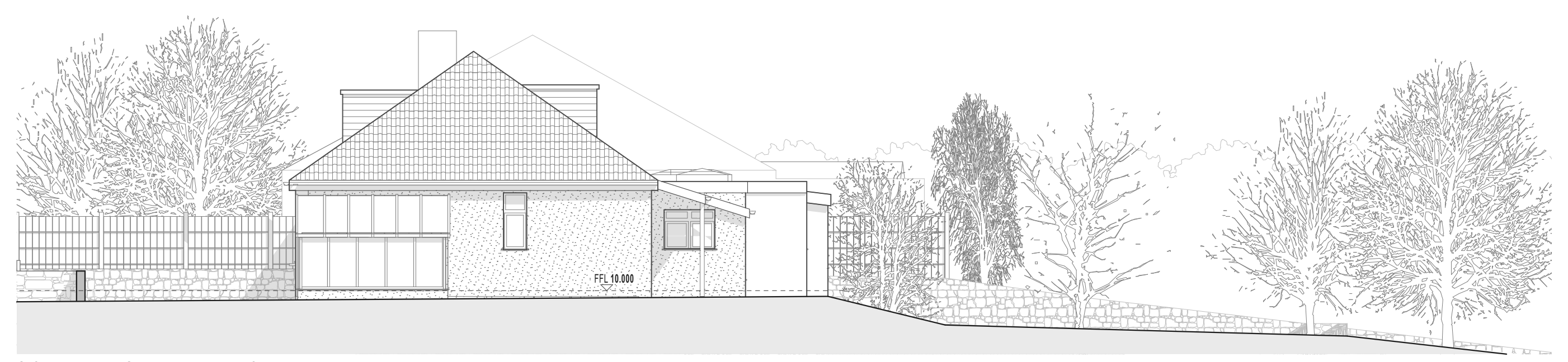
SOUTH EAST ELEVATION 1:100