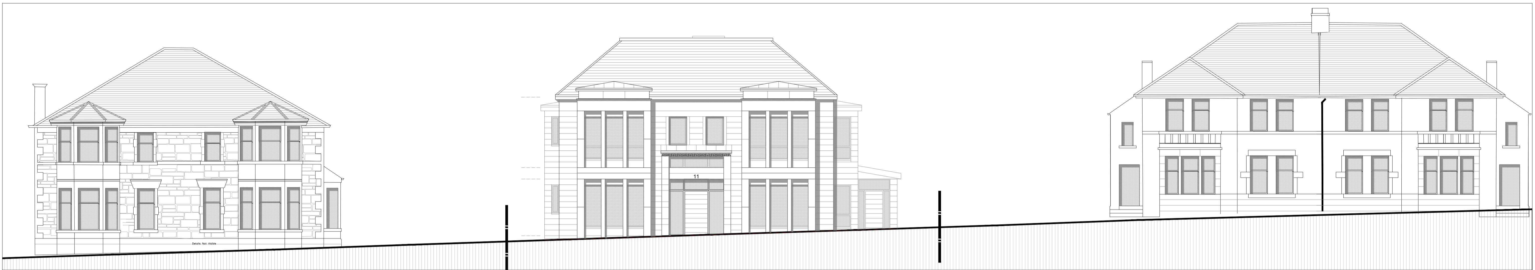
COLQUHOUN DRIVE PROSED ELEVATION 1:100