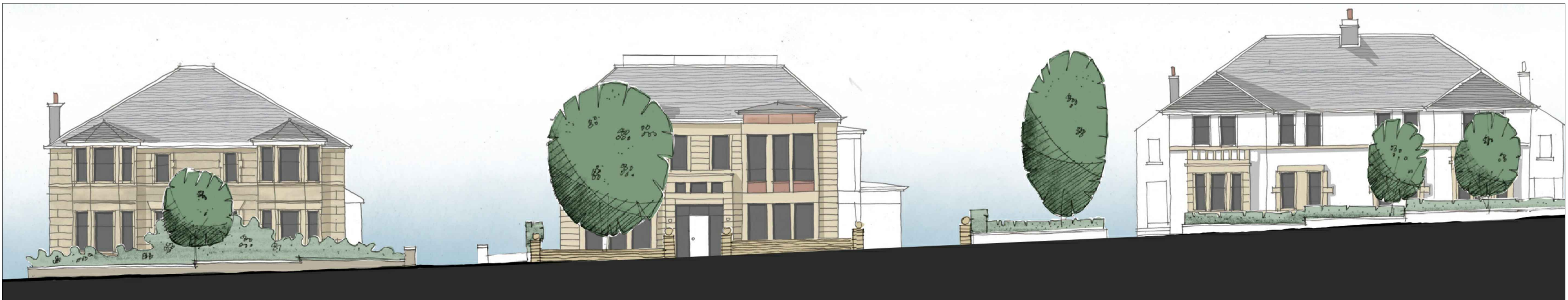
COLQUHOUN DRIVE PROSED ELEVATION (COLOUR STUDY) 1:100