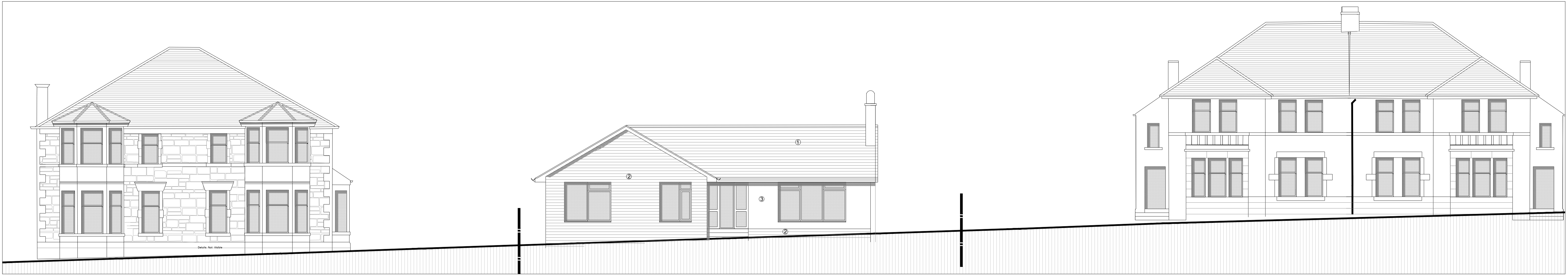
COLQUHOUN DRIVE EXISTING ELEVATION 1:100