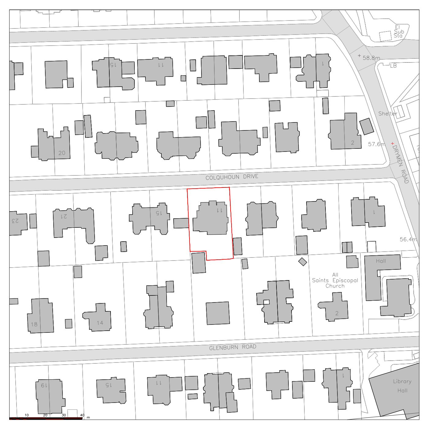
PROPOSED LOCATION PLAN