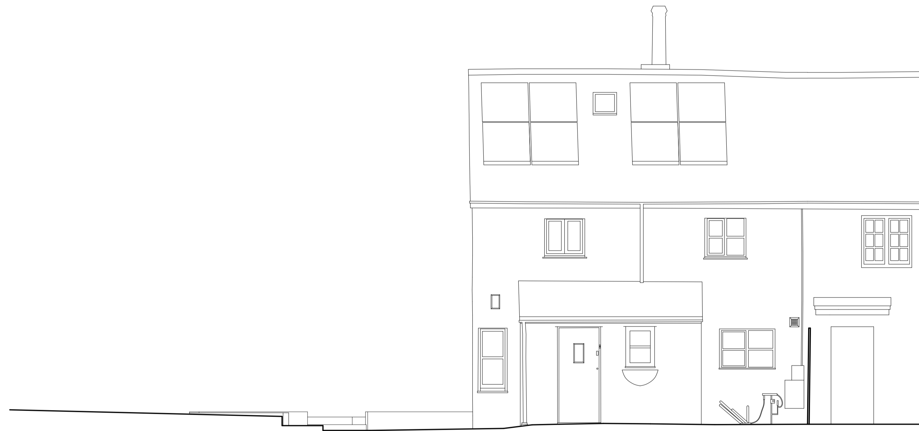
Existing South West (Front) Elevation