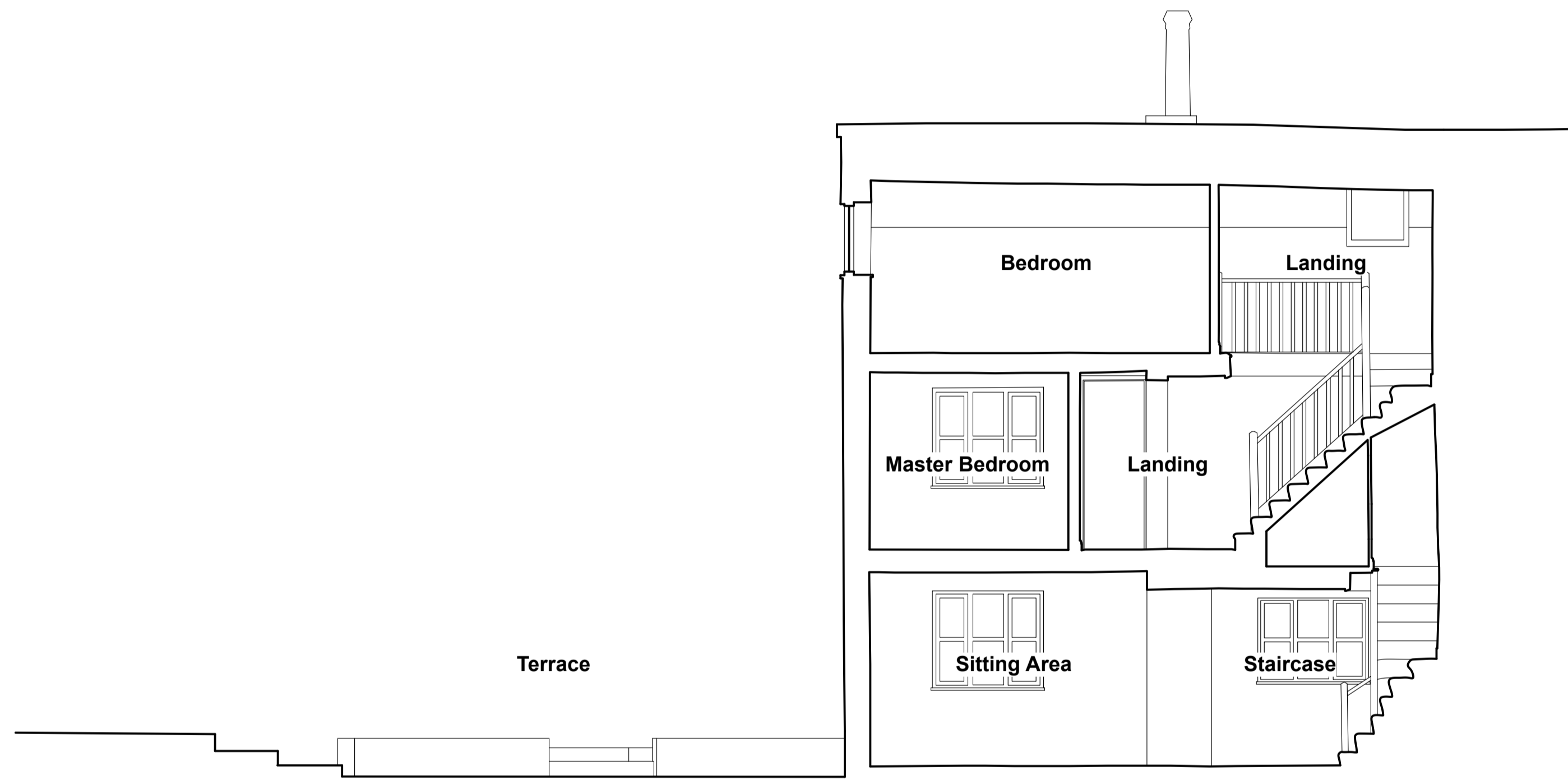
Existing Long Section