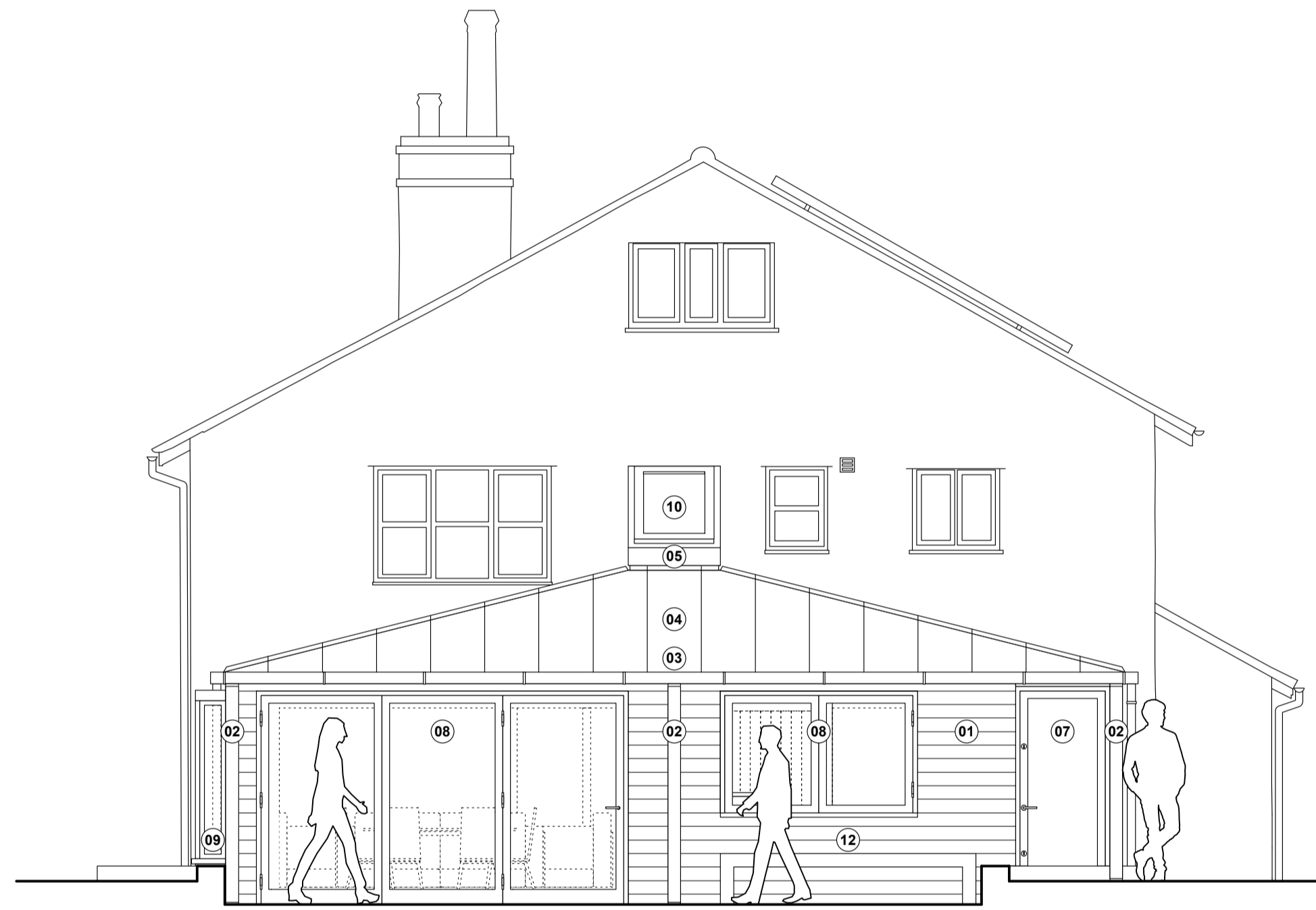
Proposed North West (Side) Elevation