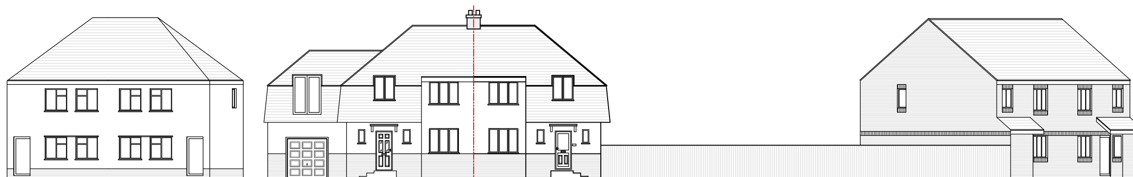
PLOT 95 A