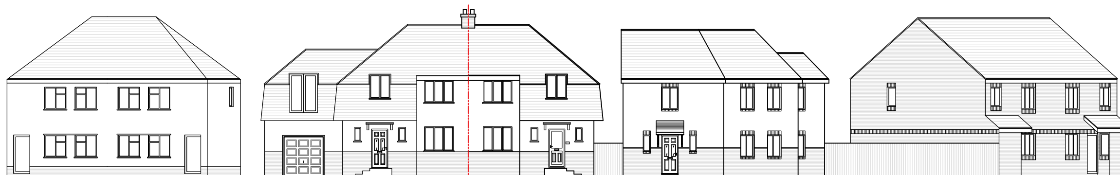
PLOT 95 A