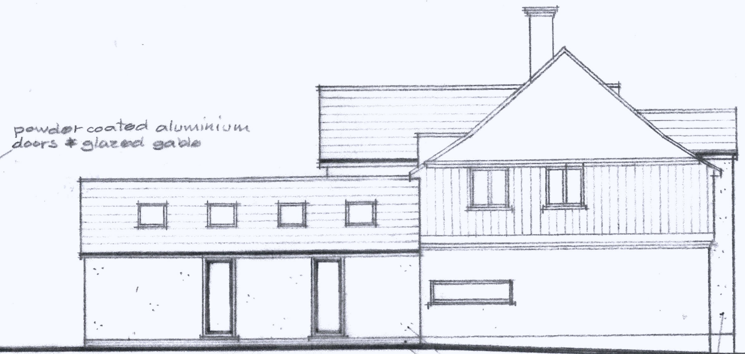
proposed side elevation

7-1-21 Amendment B projection of single storey rear extension increased by 3000mm