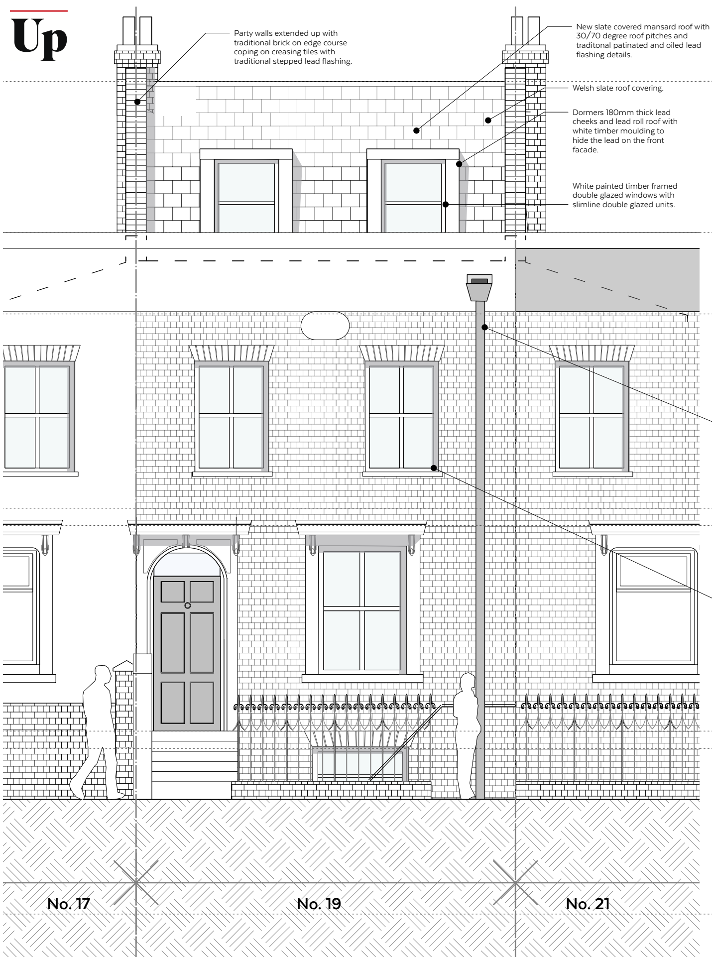
Proposed Front Elevation - 1:50 @ A3