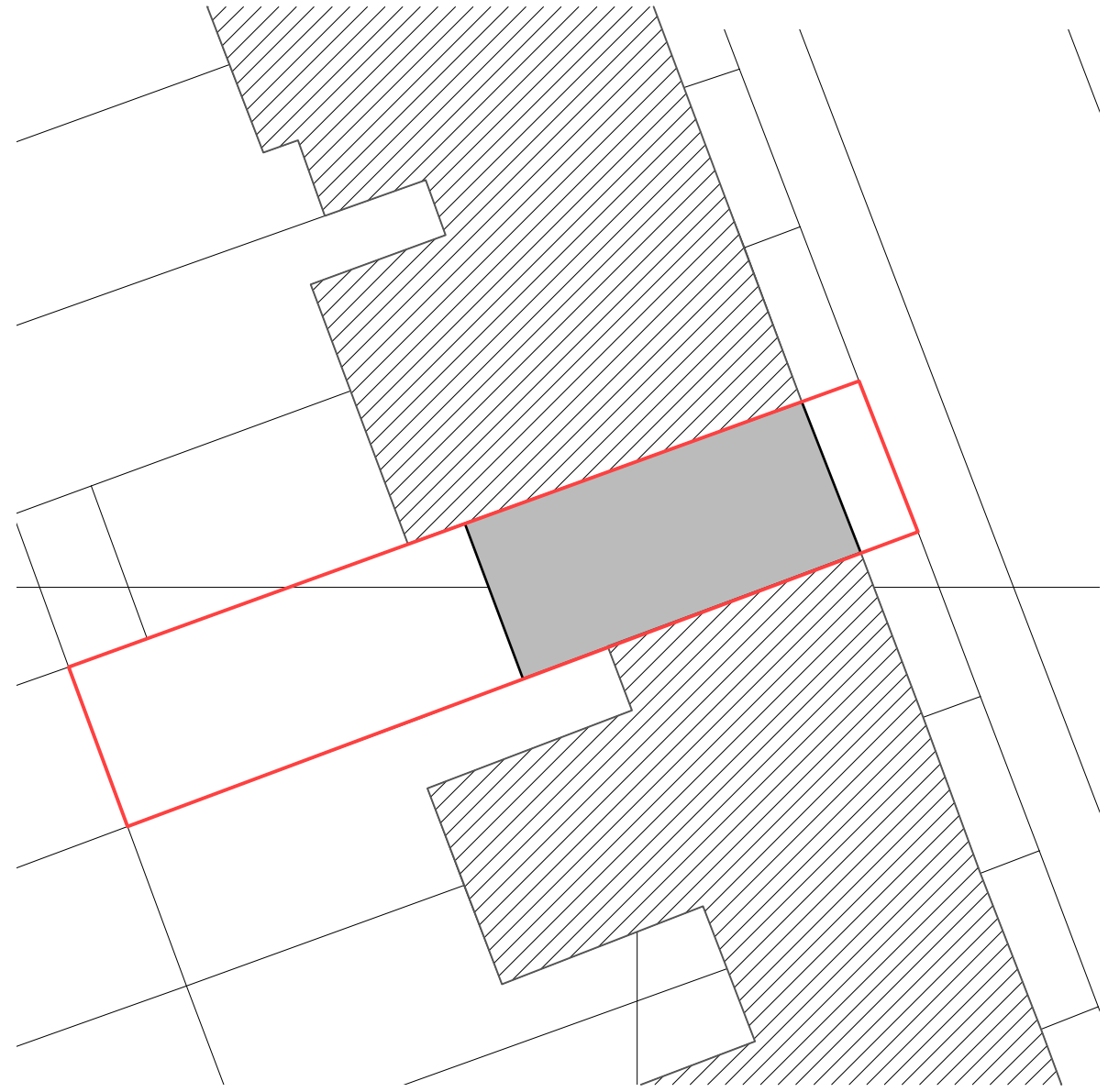
Block Plan - 1:200 @ A3