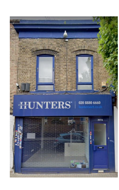
Front Elevation Photo as Existing - NTS