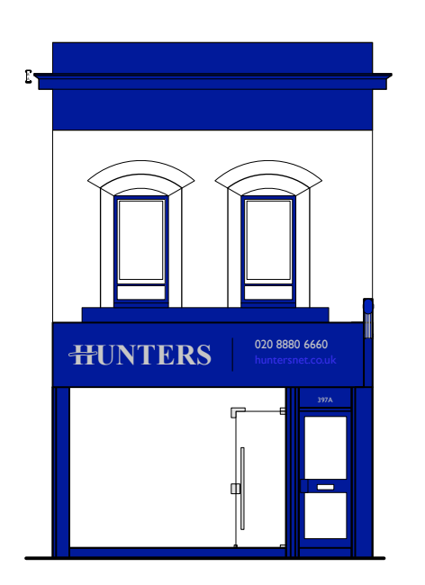
Front Elevation as Existing scale 1:100 @ A3 / 1:50 @ A1

Fascia Detail Section A-A as Proposed scale 1:20