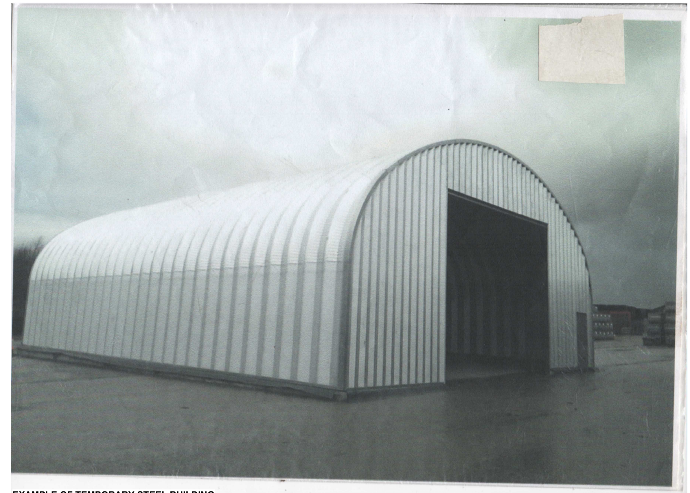
EXAMPLE OF TEMPORARY STEEL BUILDING