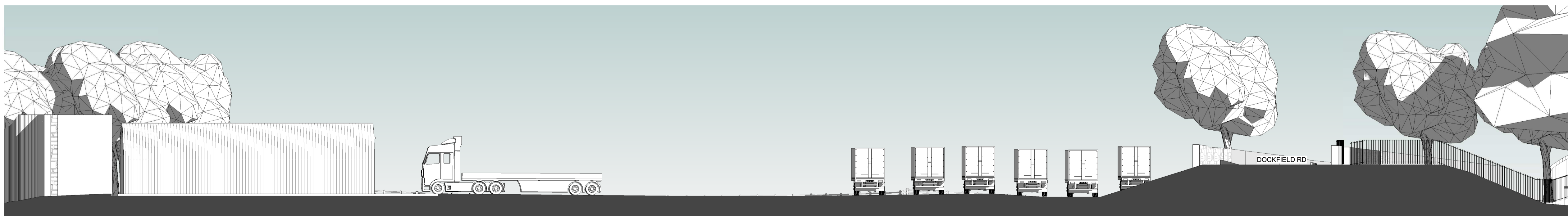
Section 4 - Proposed 1 : 200