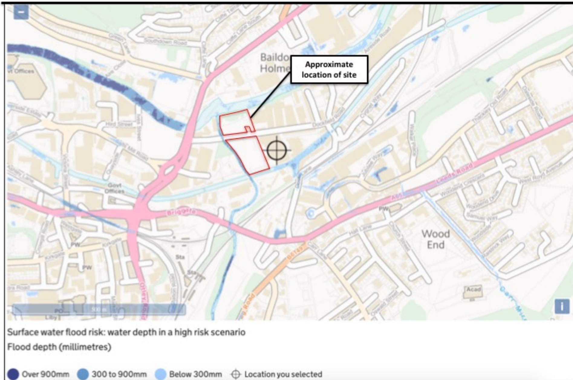
Figure 6 Environment Agency's Surface Water Flood Depth Map