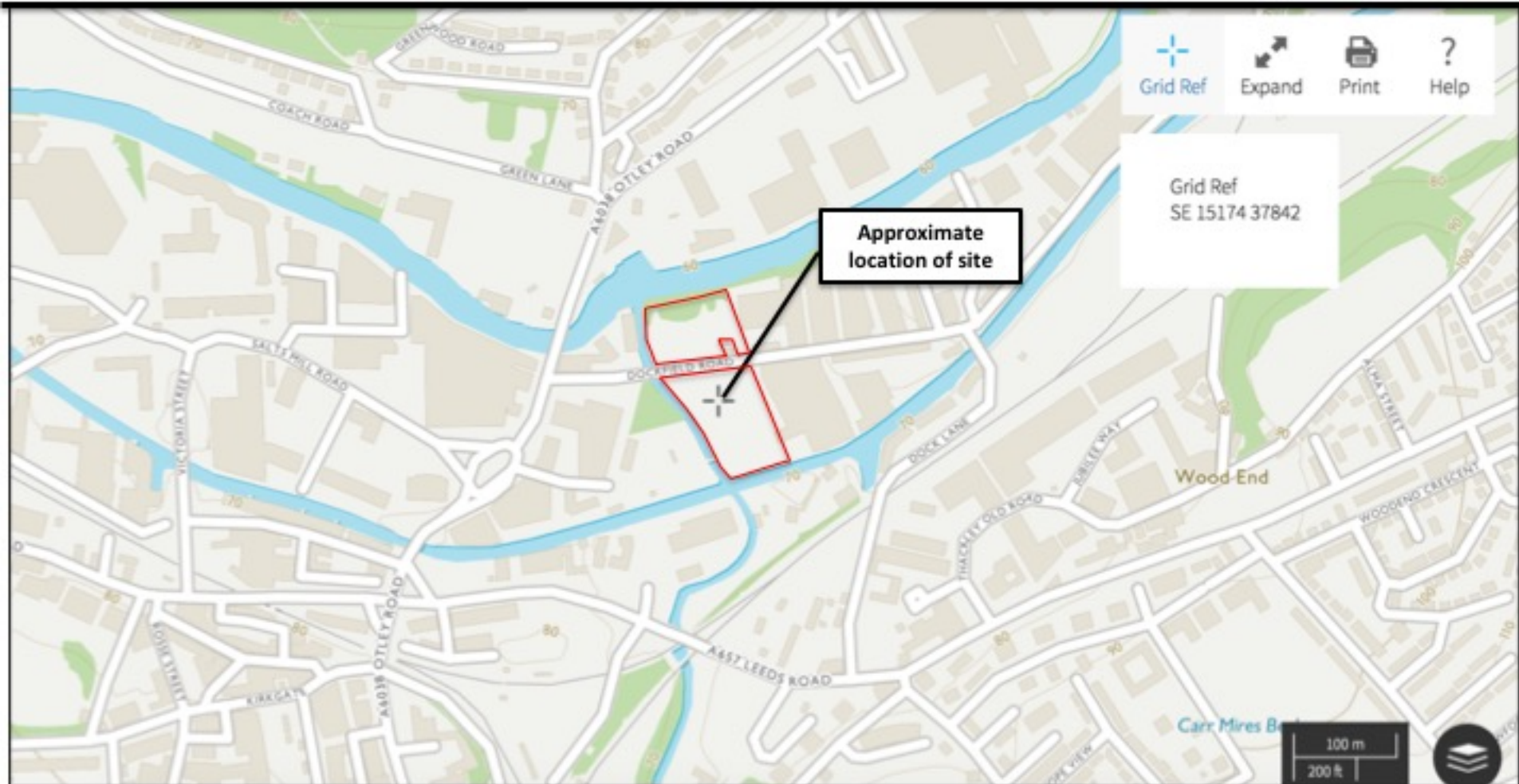
Figure 1 Site Location Map