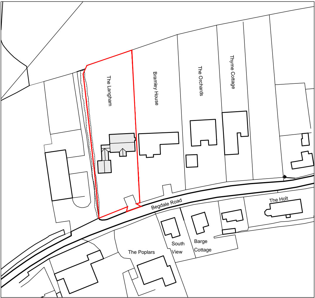
Location Plan - 1:1250