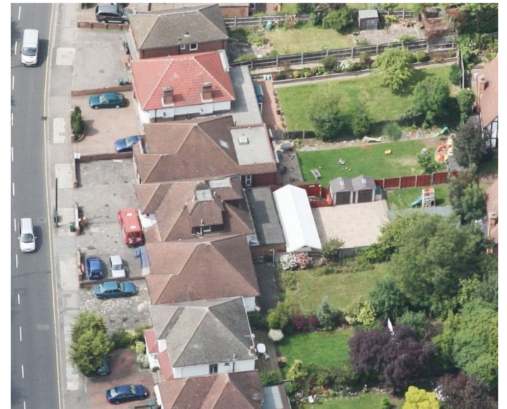
Bird's eye view (Easterly) Bing Maps