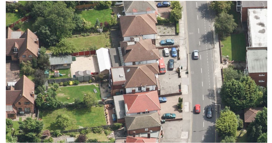
Bird's eye view (Westerly) Bing Maps