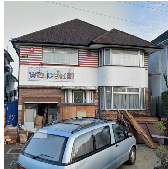
228 Hale Lane