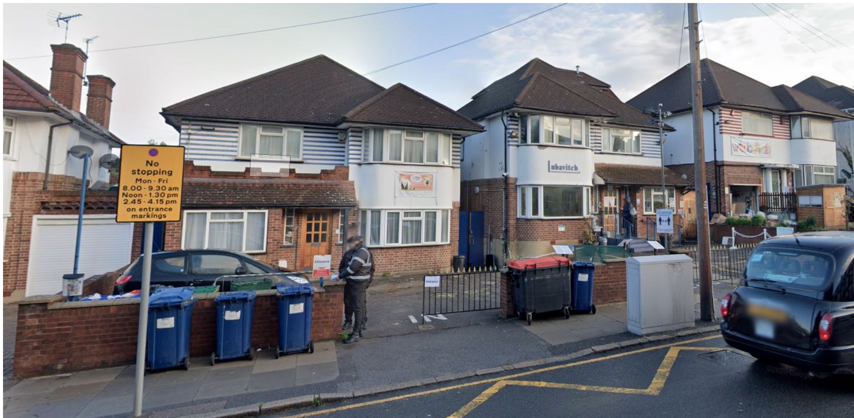
Extent of site