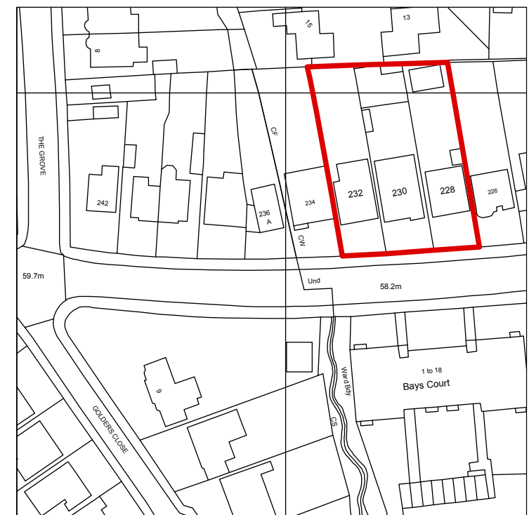
OS Location Map 1:1250 @ A3