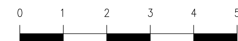
Scale Bar (Metres)