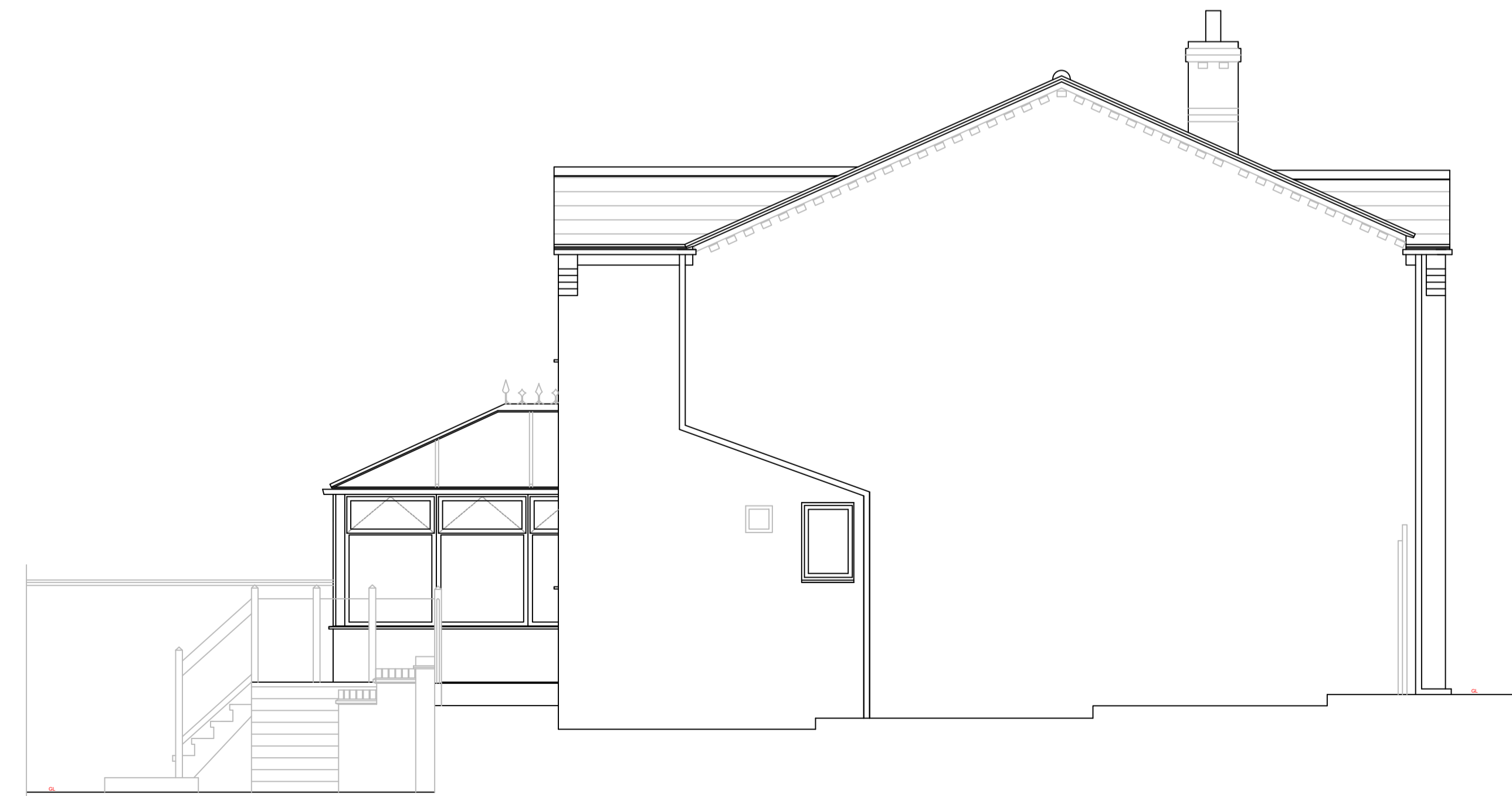
Existing Left Hand Side Elevation