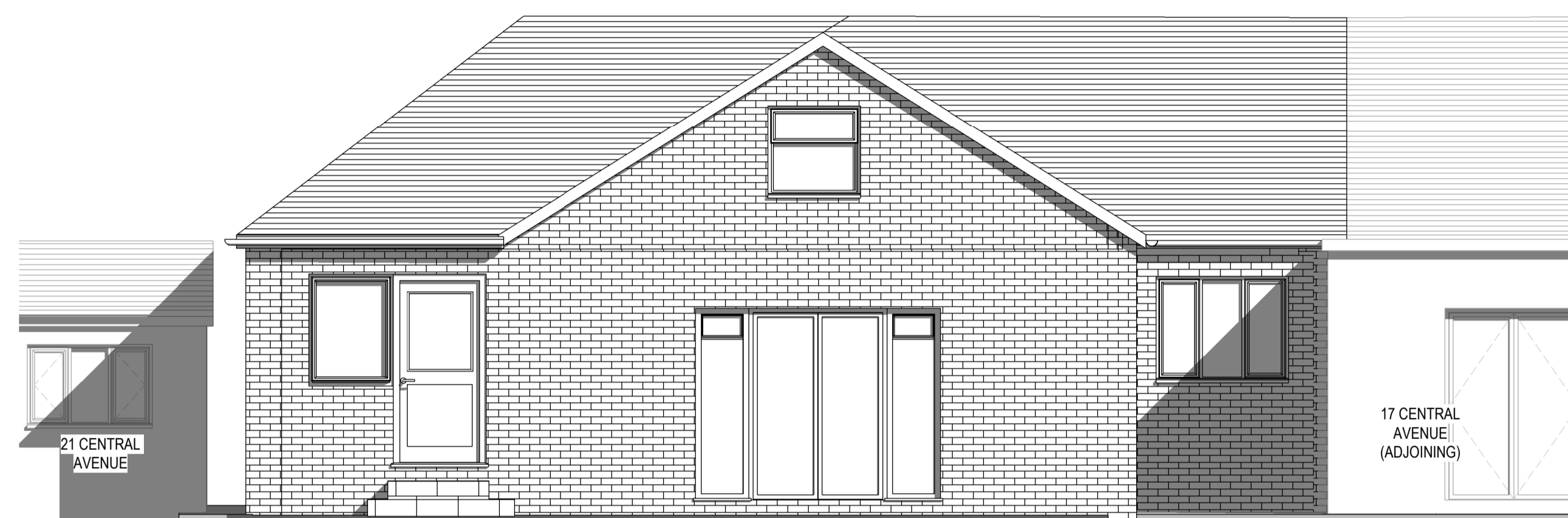
EXISTING REAR ELEVATION 1:50