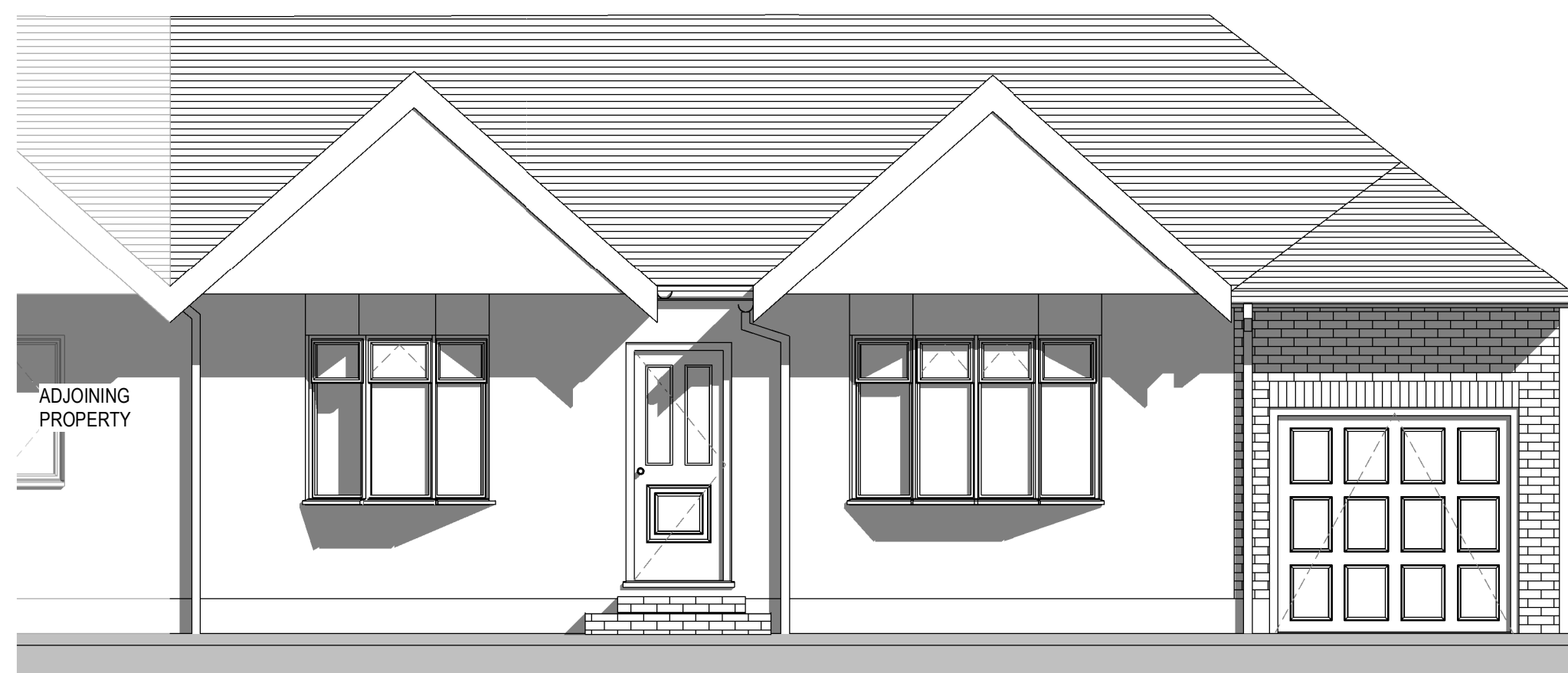
EXISTING FRONT ELEVATION 1 : 50