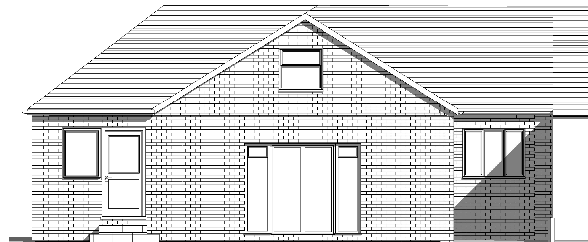
EXISTING REAR ELEVATION 1 : 50