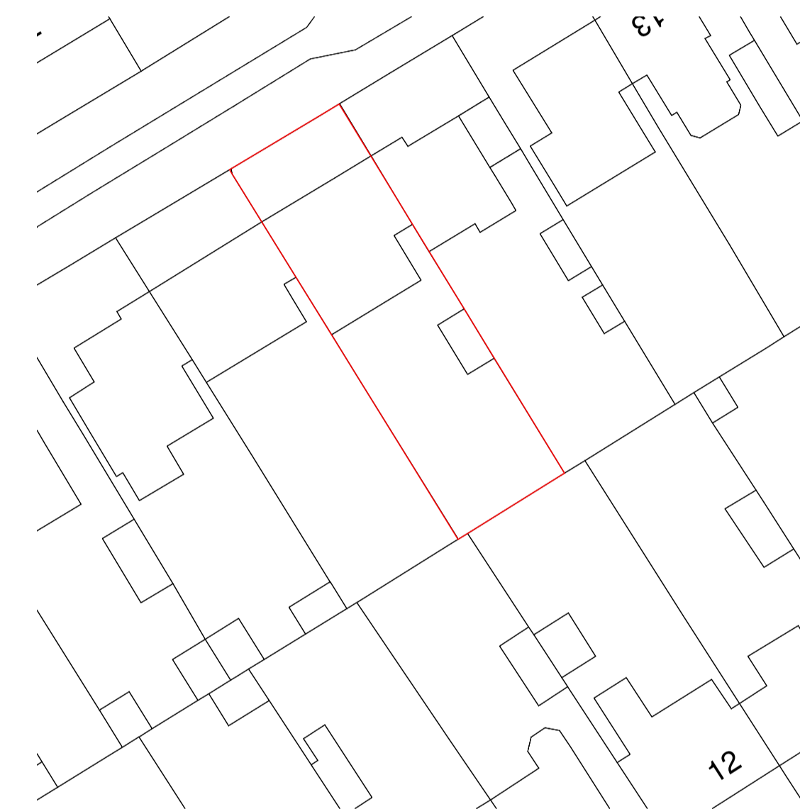
SITE PLAN 1 : 500