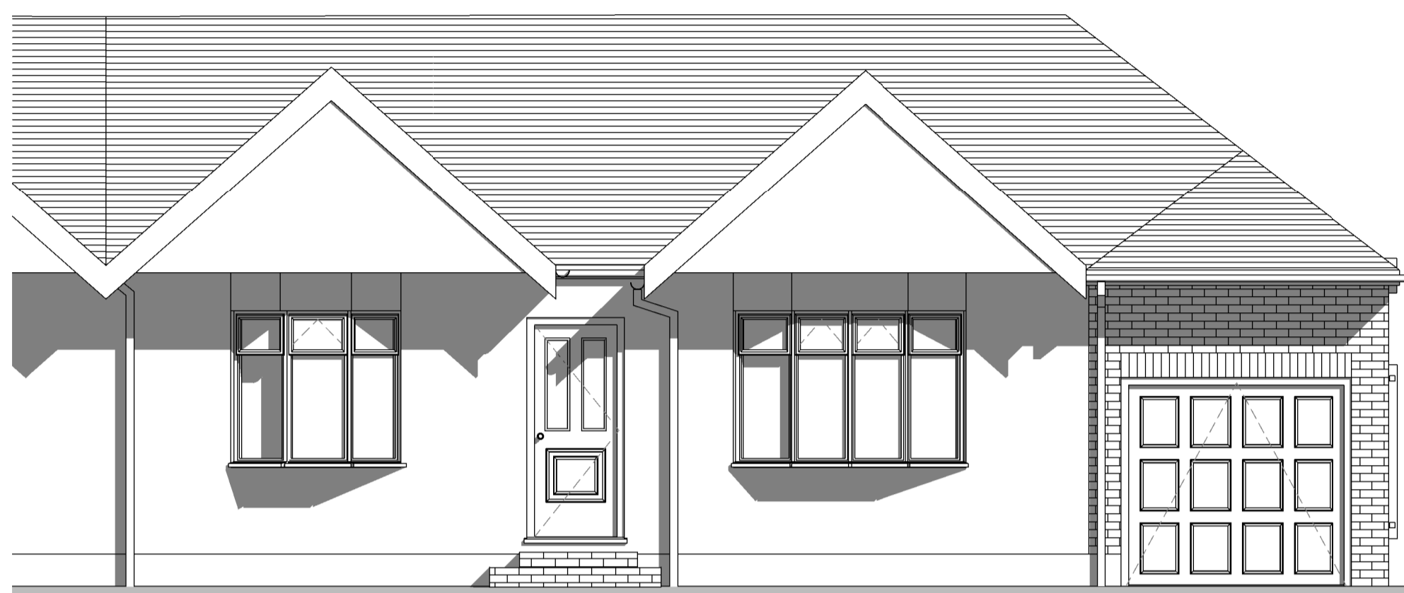
PROPOSED FRONT ELEVATION 1 : 50