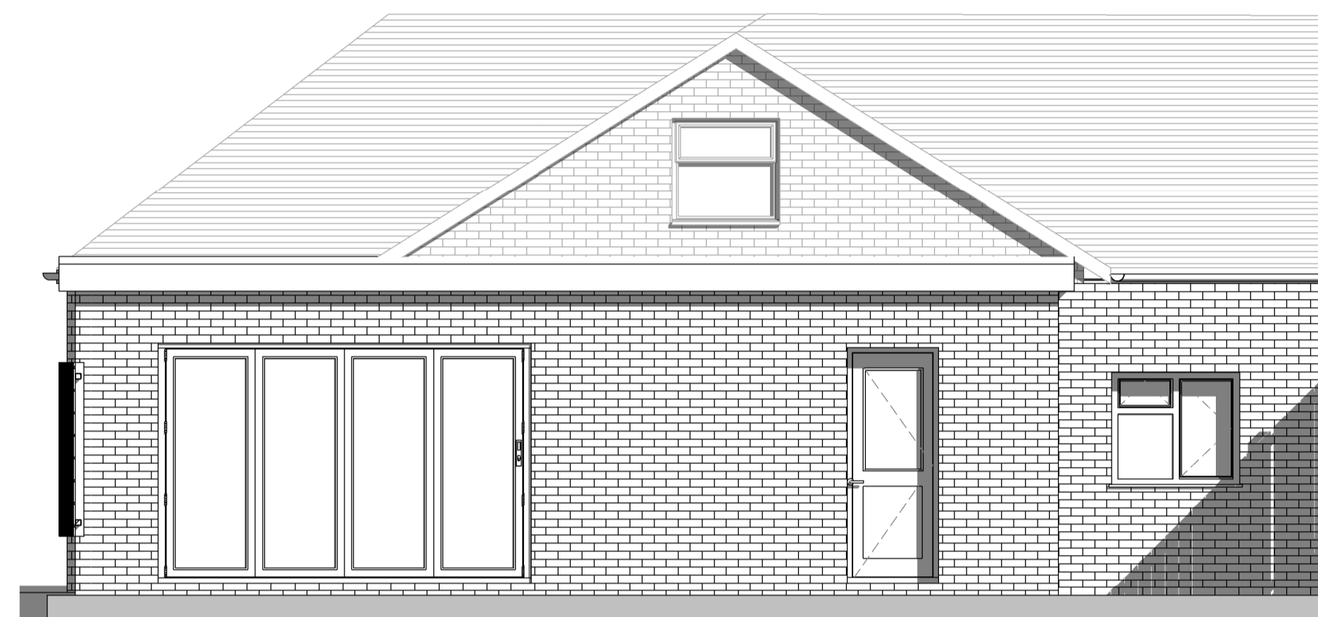
PROPOSED REAR ELEVATION 1 : 50