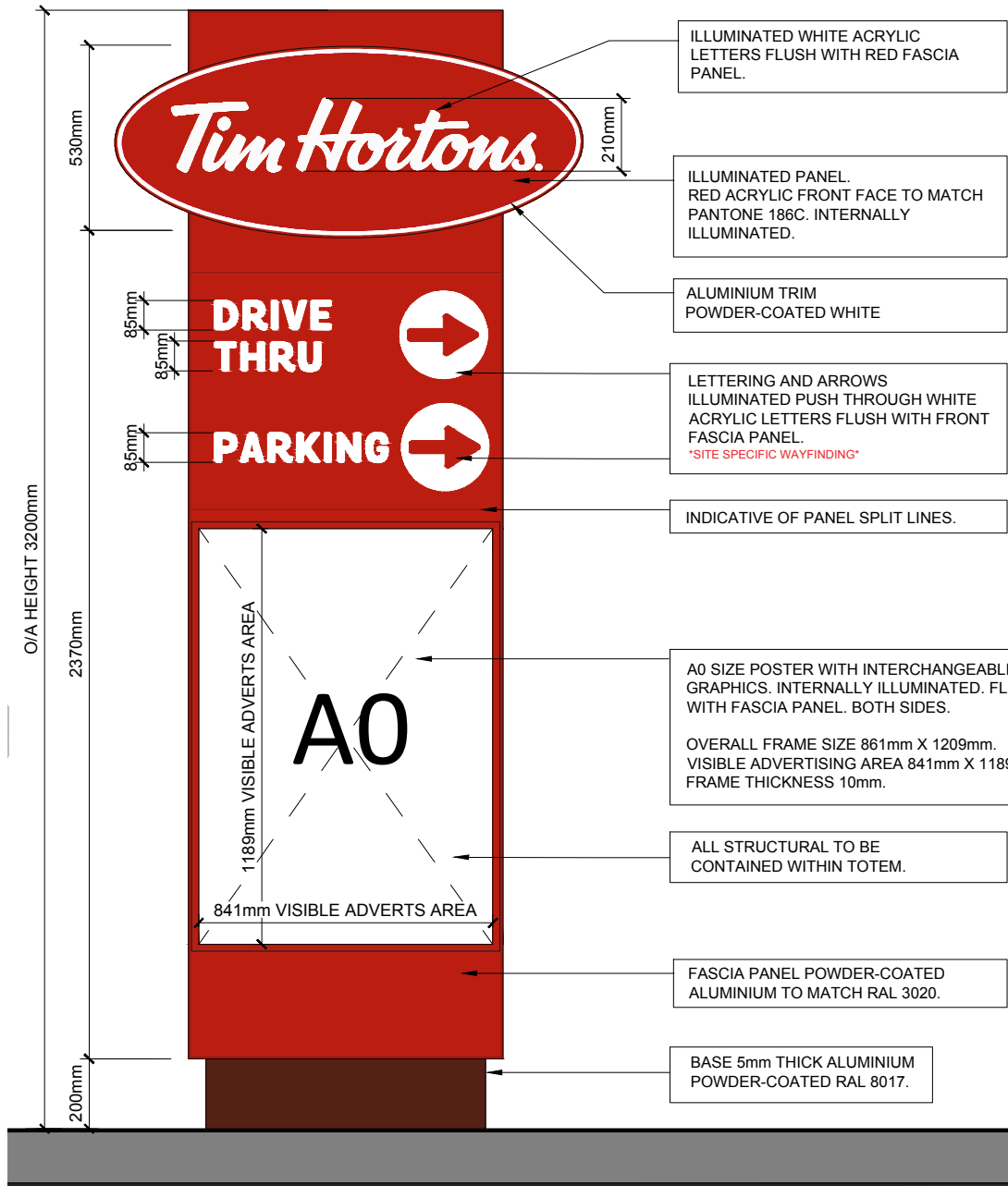
2 FRONT ELEVATION Scale: 1:20