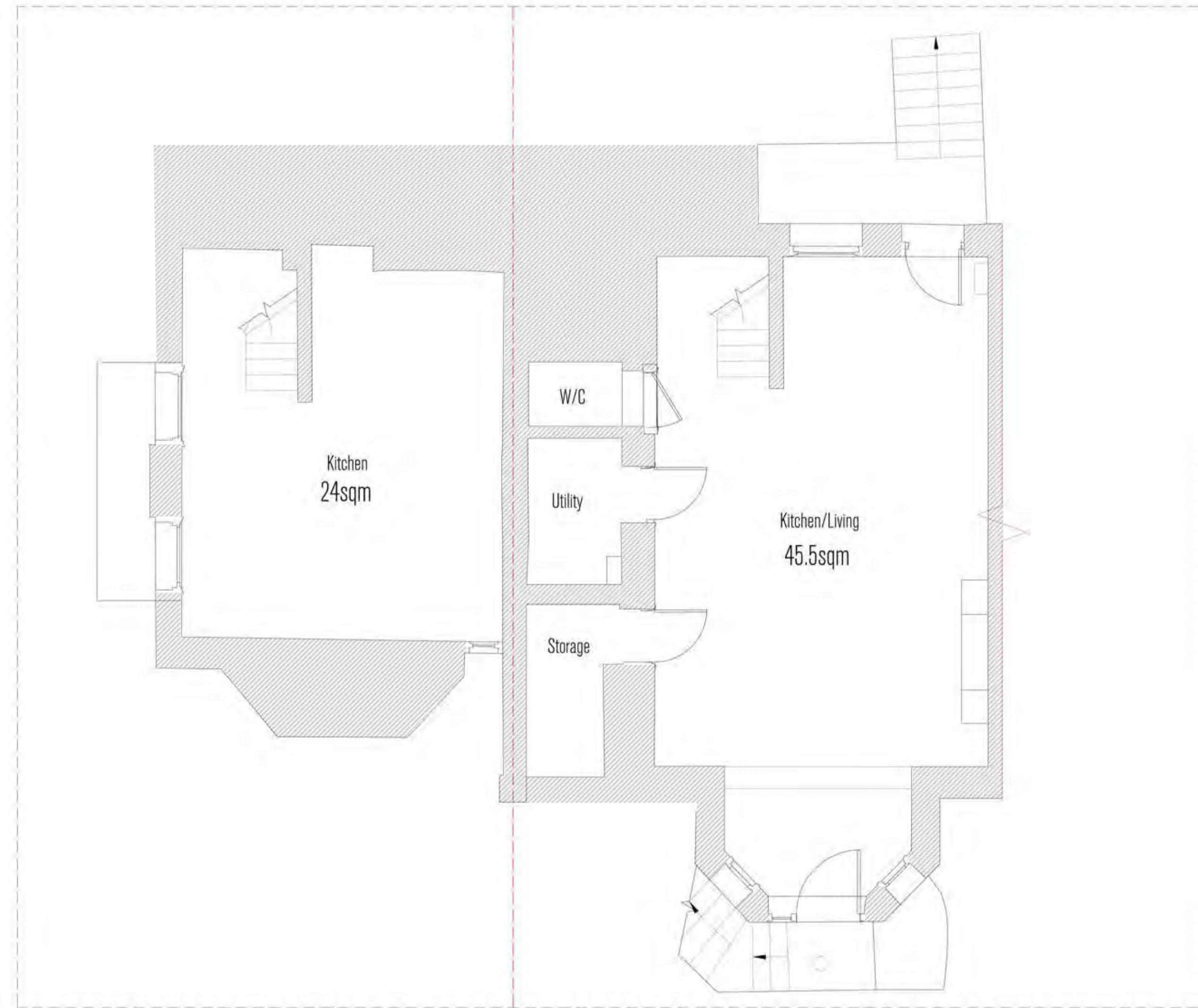
Proposed House 1 Basement Floor Plan