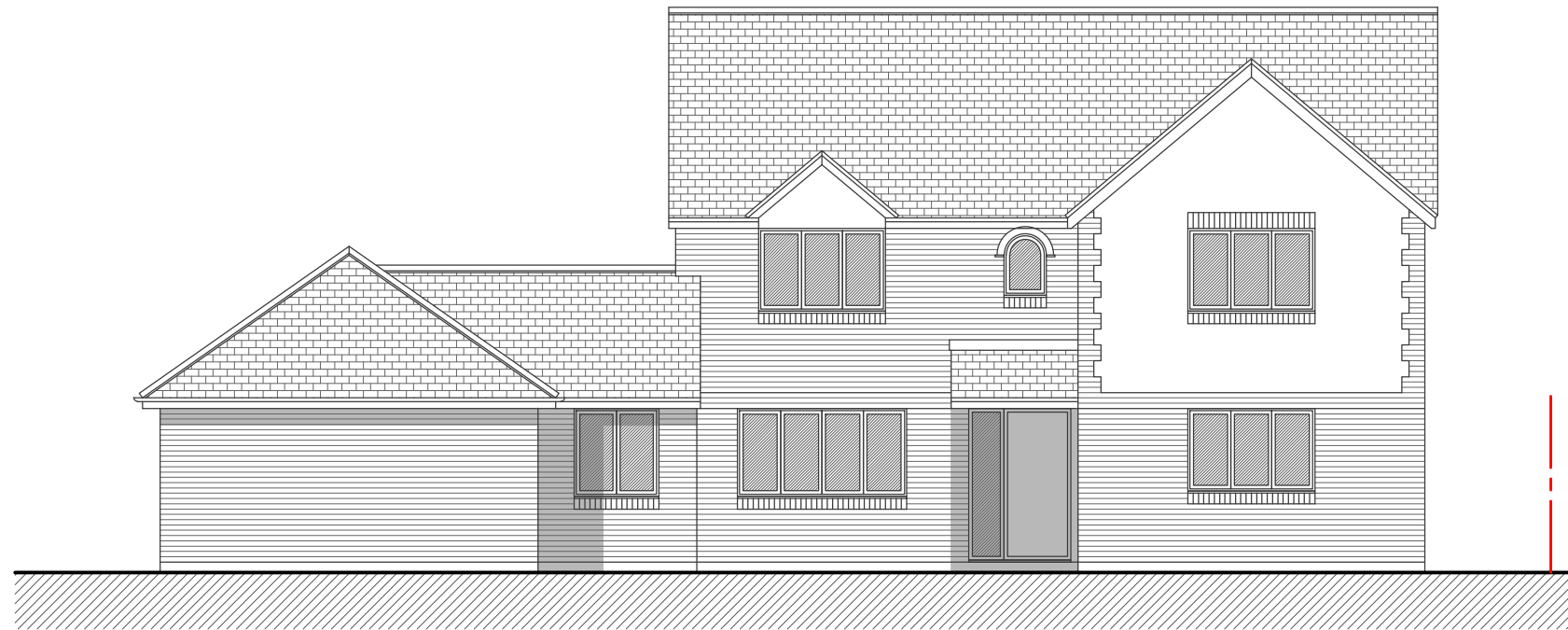
proposed drawing SIDE ELEVATION