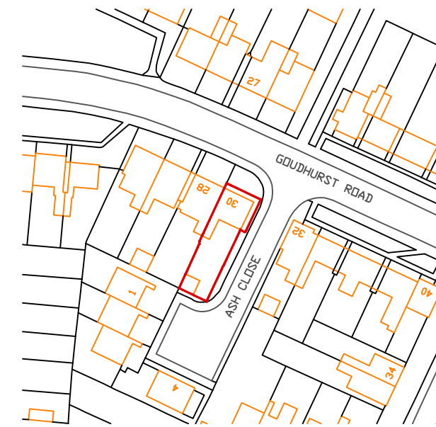
OS PLAN REF: v1c/523224/708828