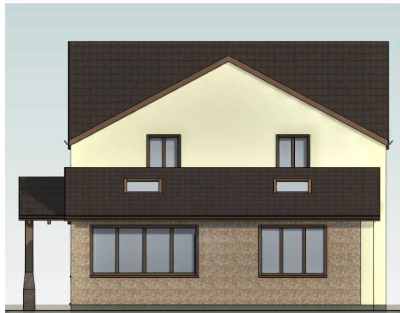
Rear Elevation (full) 1 : 100