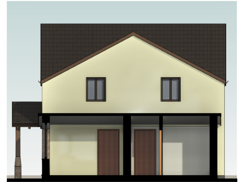
Rear Elevation (partial) 1 : 100