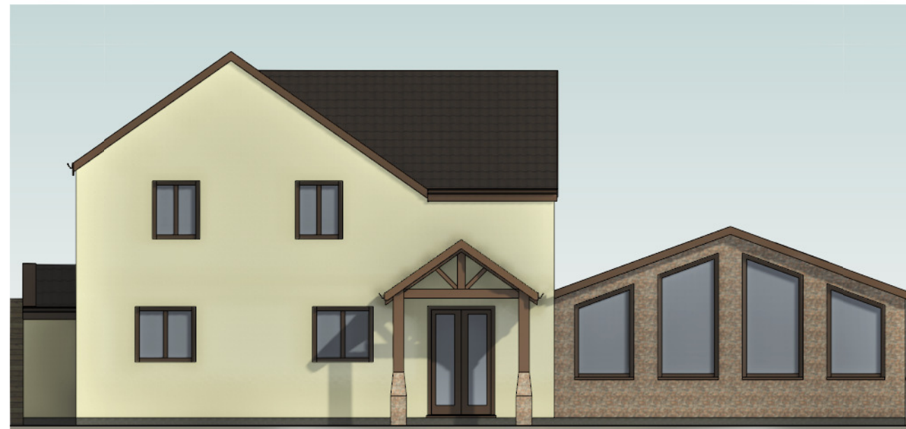
Side Elevation 1 : 100