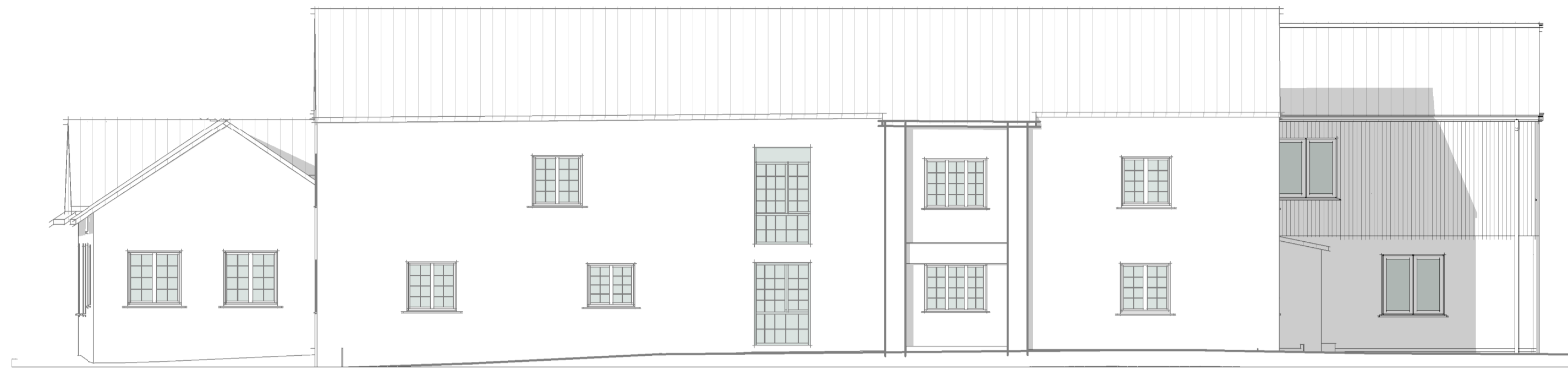
East Elevation 0 2m 1 : 100

Windows & Doors: white UPVC to match existing.