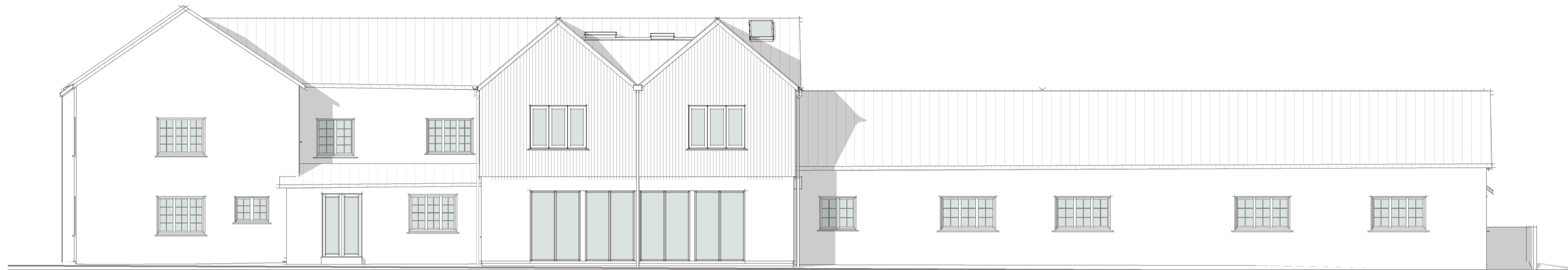
North Elevation 0 2m 1 : 100