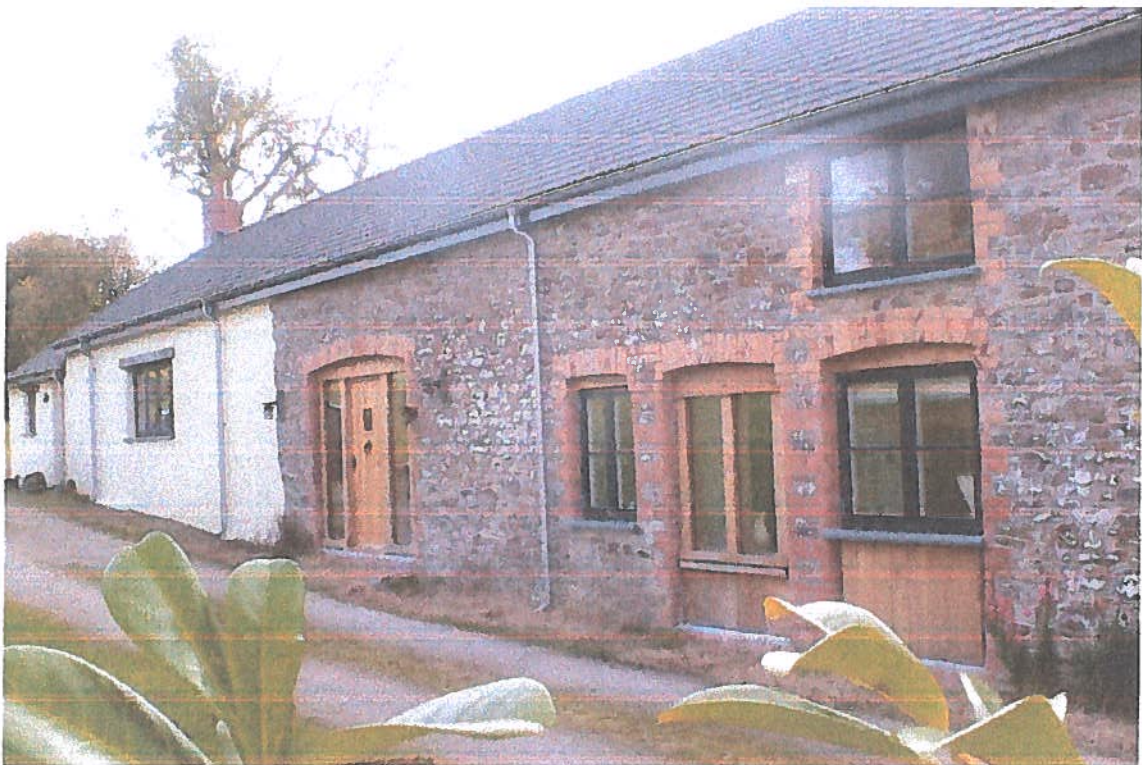
ADJOINING PROPERTY "SWAN GRANGE" WITH PROMINENT OAK FEATURES.