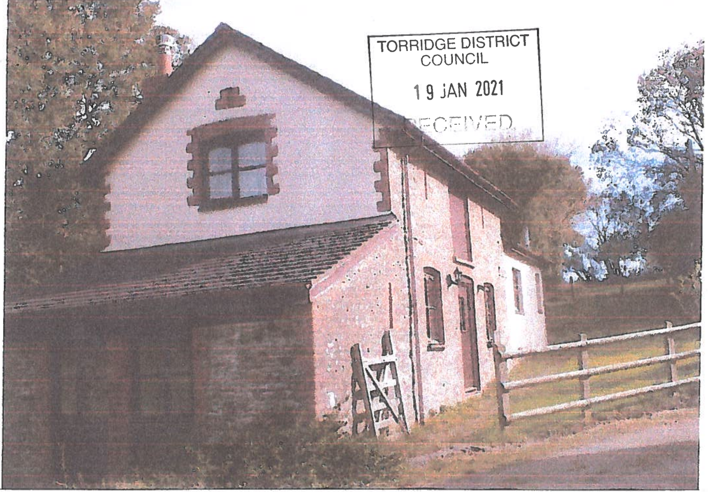
HOOPERS · HIGH BUCKINGTON · UMBERLEIGH · EX 37 9BU