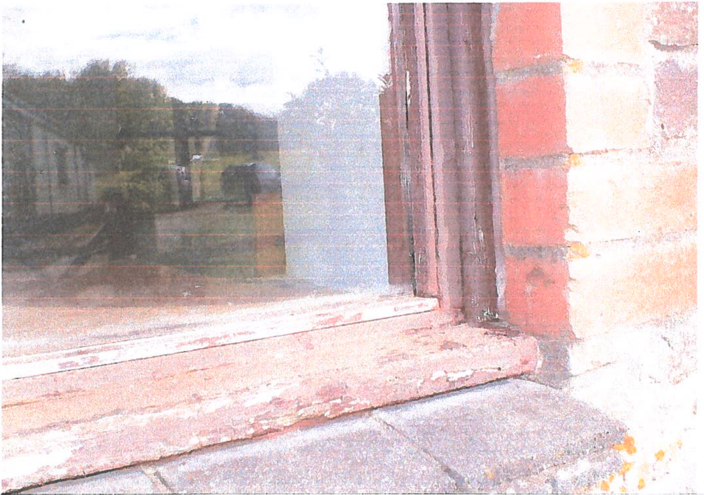
EXISTING SOFTWOOD WINDOWS BADLY DECAYED - TO BE REPLACED WITH RESIDENCE 7 PVCU IRISH OAK WINDOWS