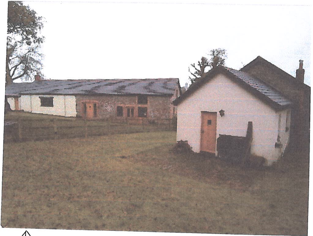
↑ "SWAN GRANGE" & ADJOINING PROPERTY "HOOPERS" ↑