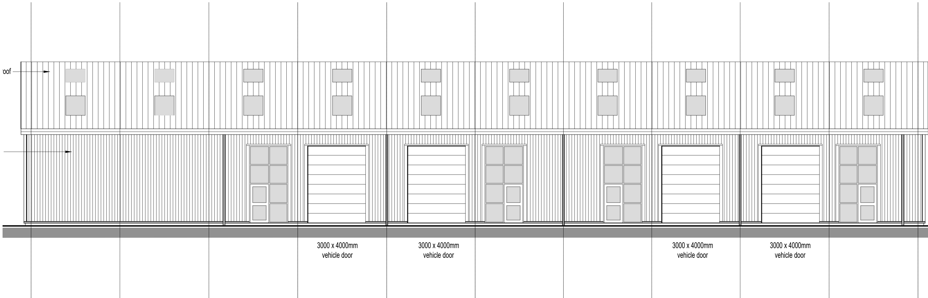
NORTH EAST ELEVATION PHASE 1: