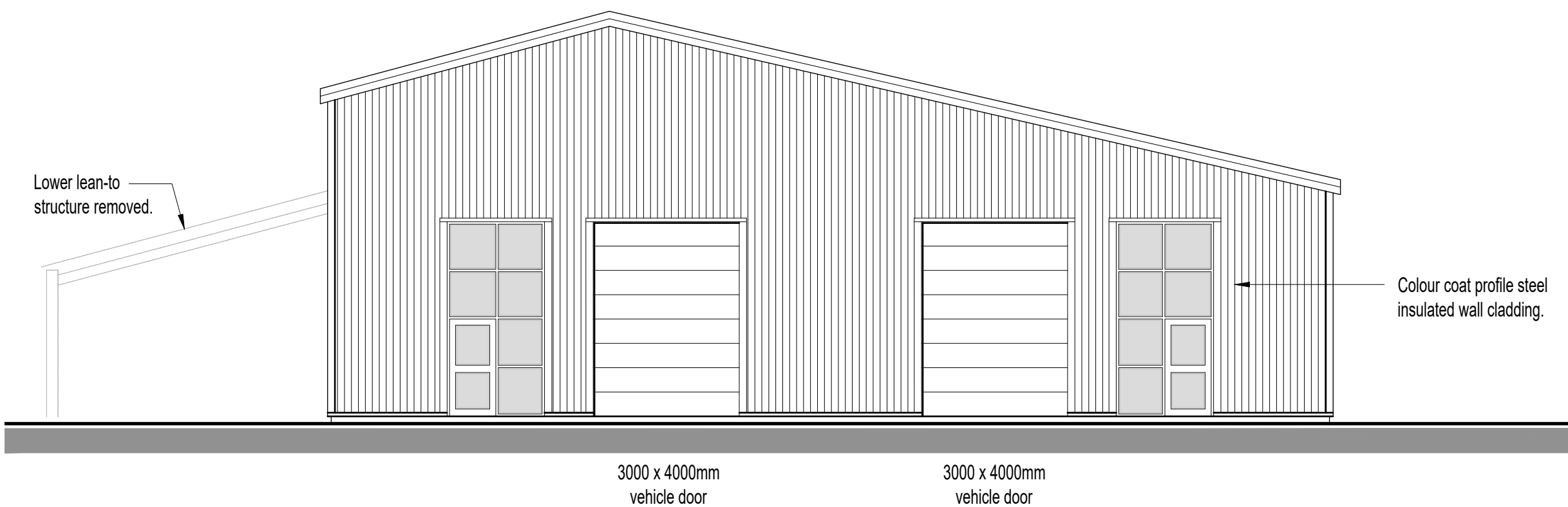
SOUTH EAST ELEVATION PHASE 1: