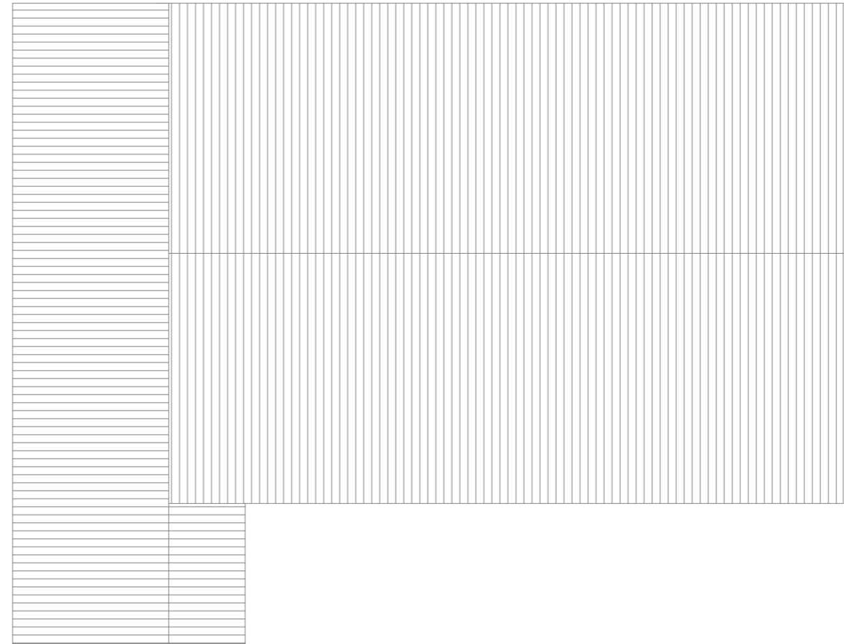
EXISTING ROOF PLAN