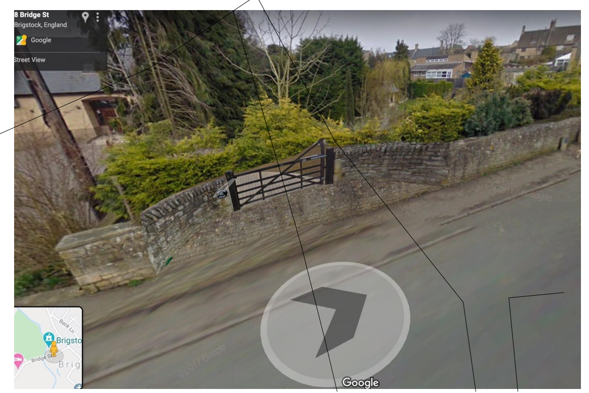
INDICATIVE ILLUSTRATION OF PROPOSED ACCESS