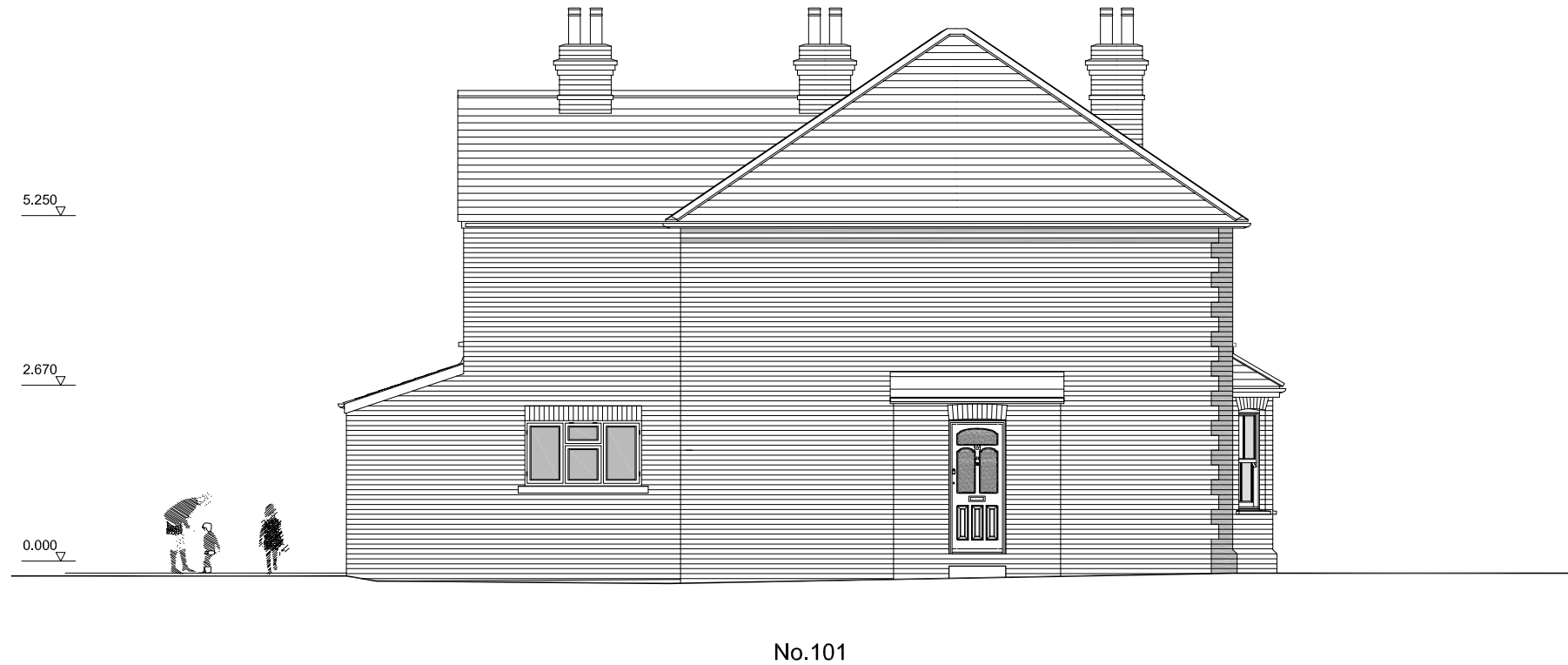
SIDE ELEVATION (South East)

Loft _____ 5.250 ▽ First floor _____ 2.670 ▽ Ground floor _____ 0.000 ▽