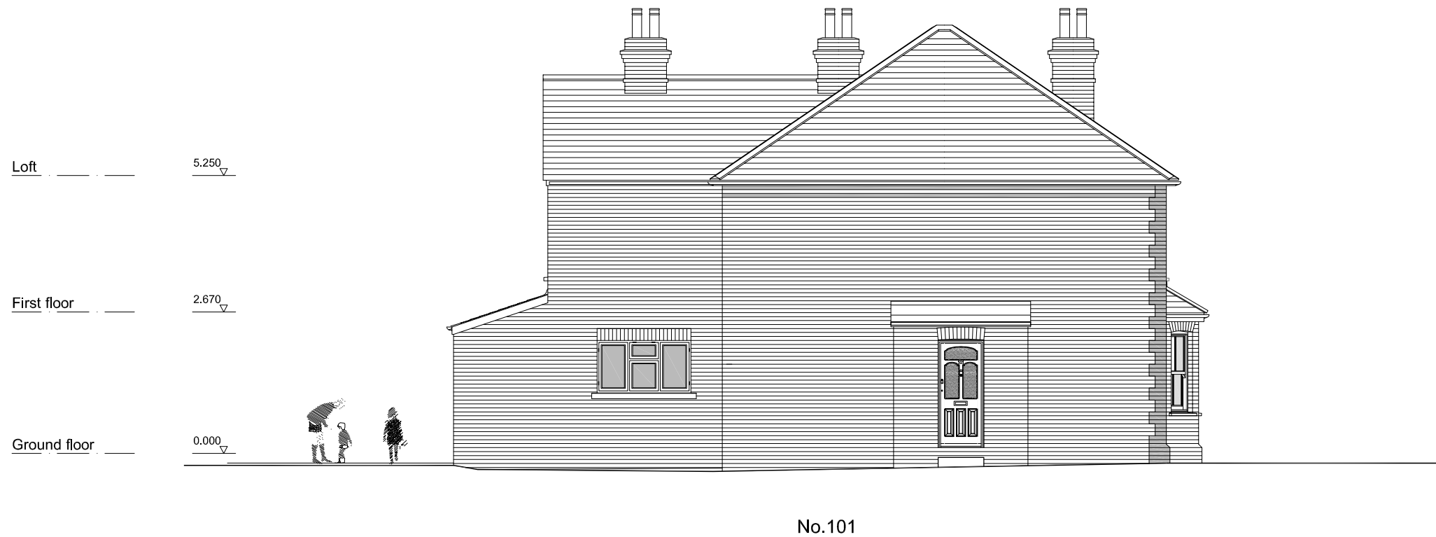
SIDE ELEVATION (South East)