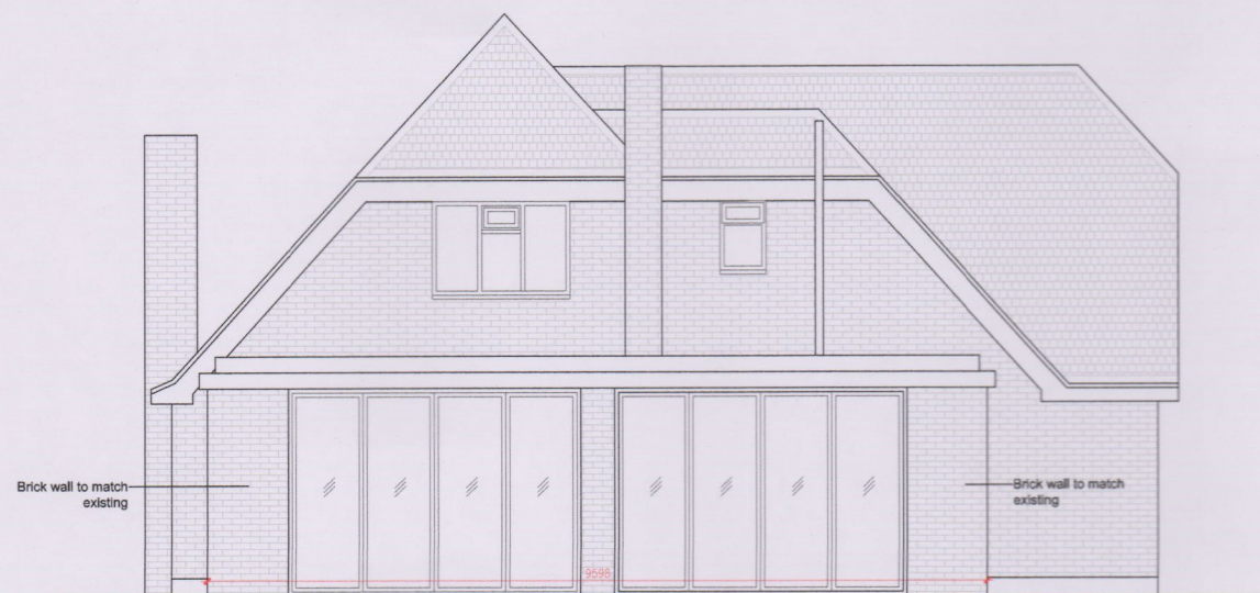
3 Proposed North Elevation 1/100