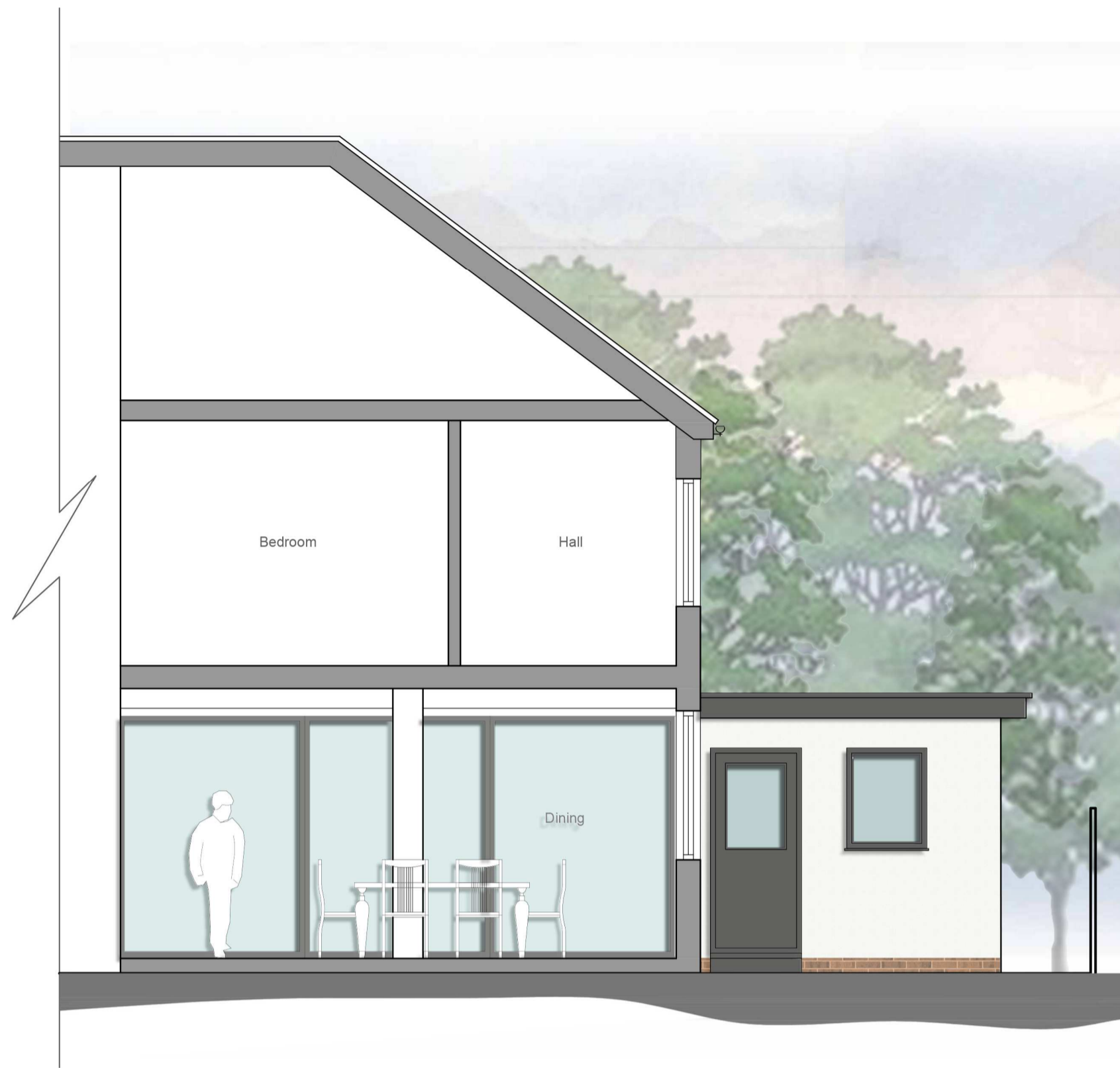
PROPOSED SECTION THRO / FRONT ELEVATION