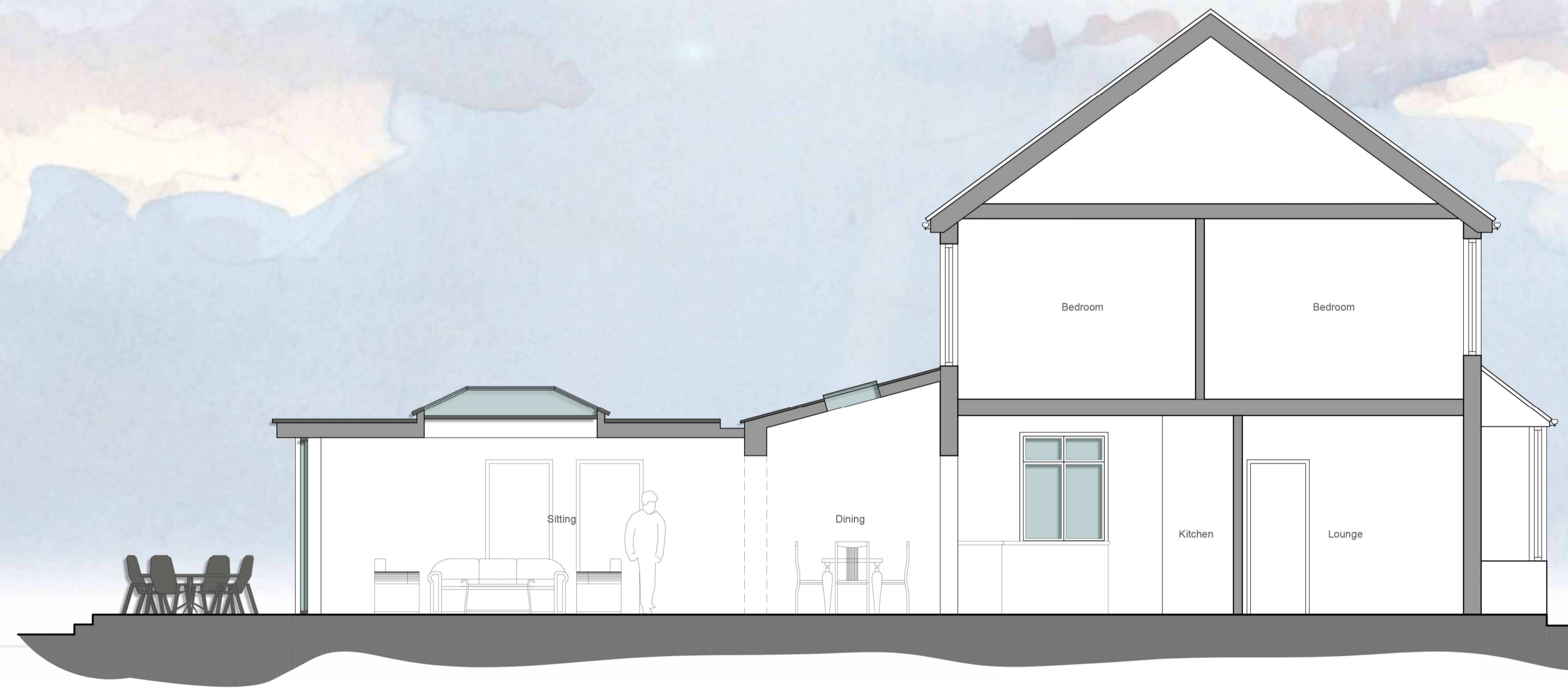
PROPOSED SECTION THROUGH'