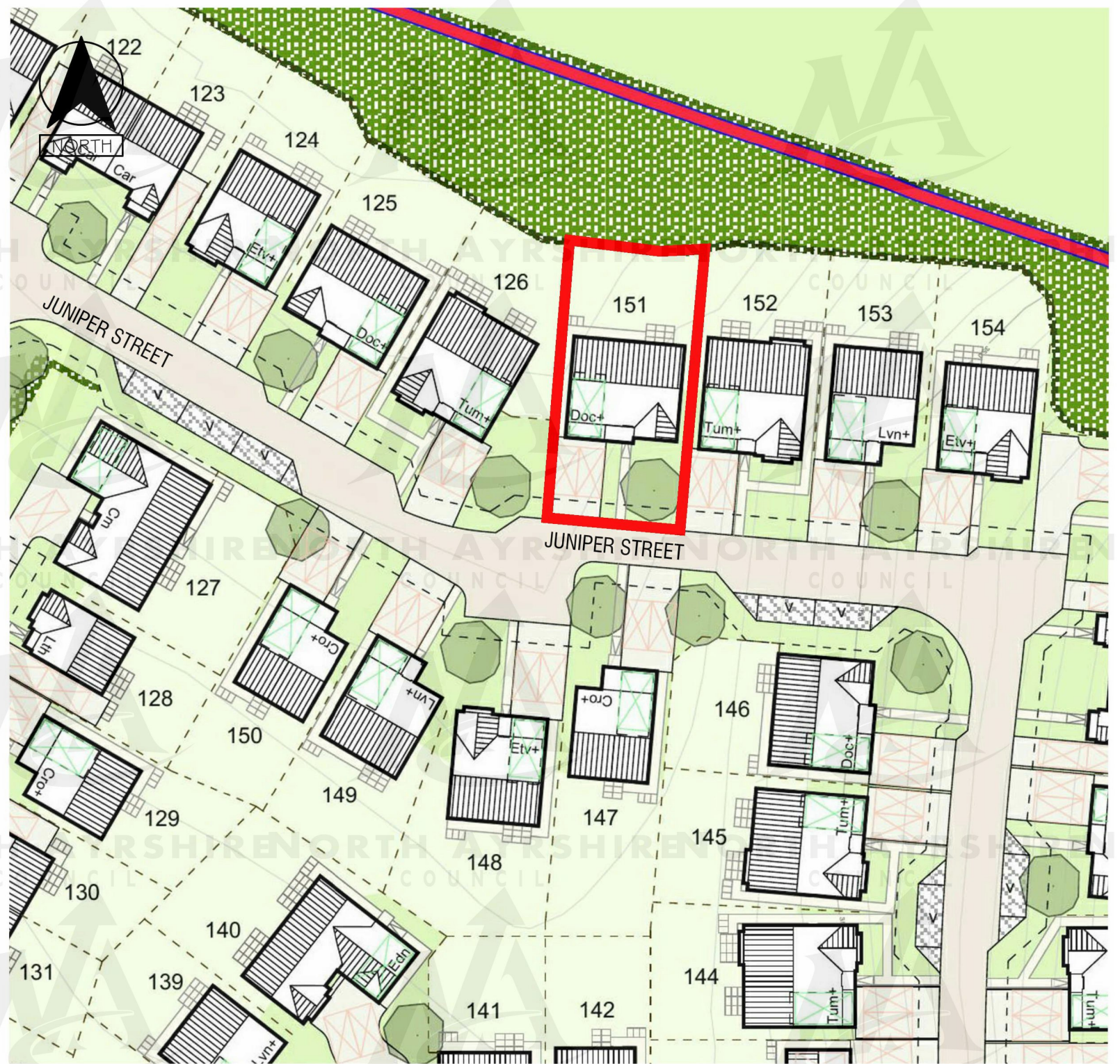
BLOCK PLAN AS EXISTING SCALE 1:500