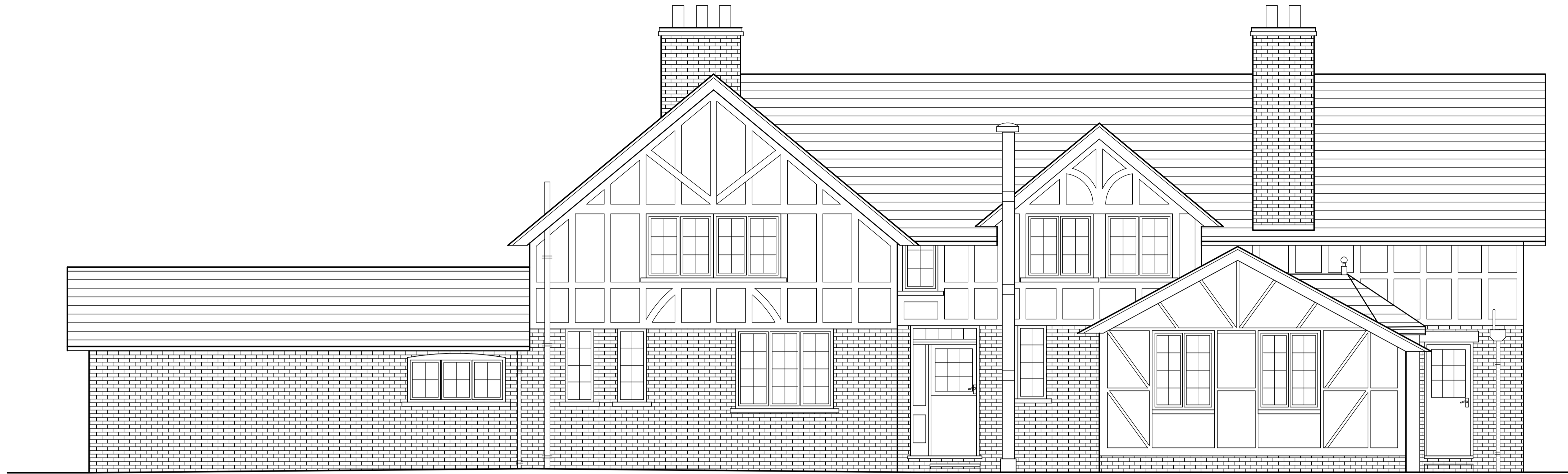
EXISTING NORTH WEST FACING ELEVATION 1:50