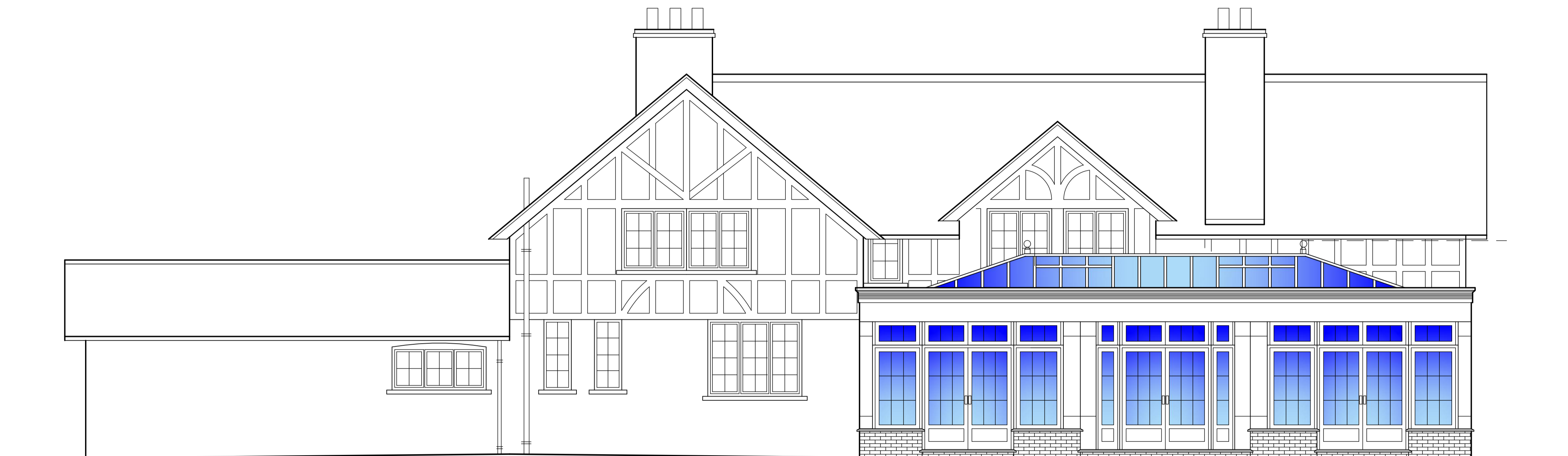
PROPOSED NORTH WEST FACING ELEVATION 1:50