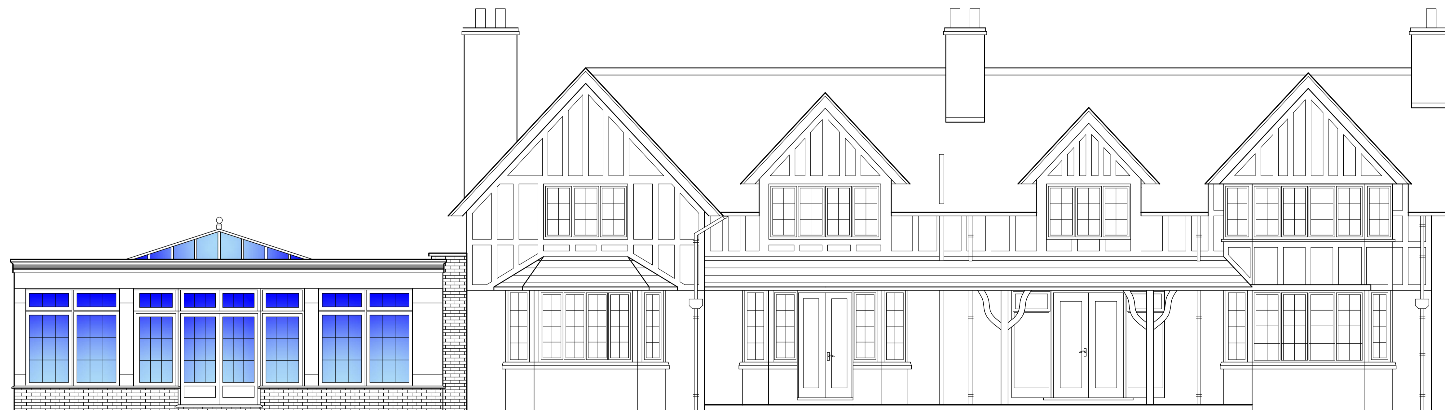
PROPOSED SOUTH WEST FACING ELEVATION 1:50