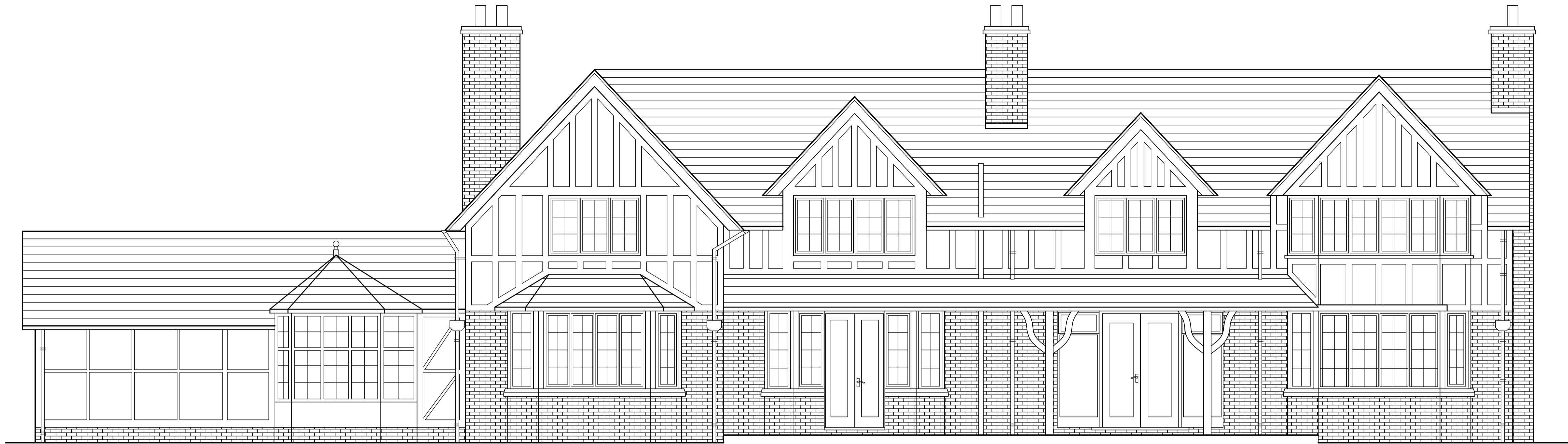
EXISTING SOUTH WEST FACING ELEVATION 1:50