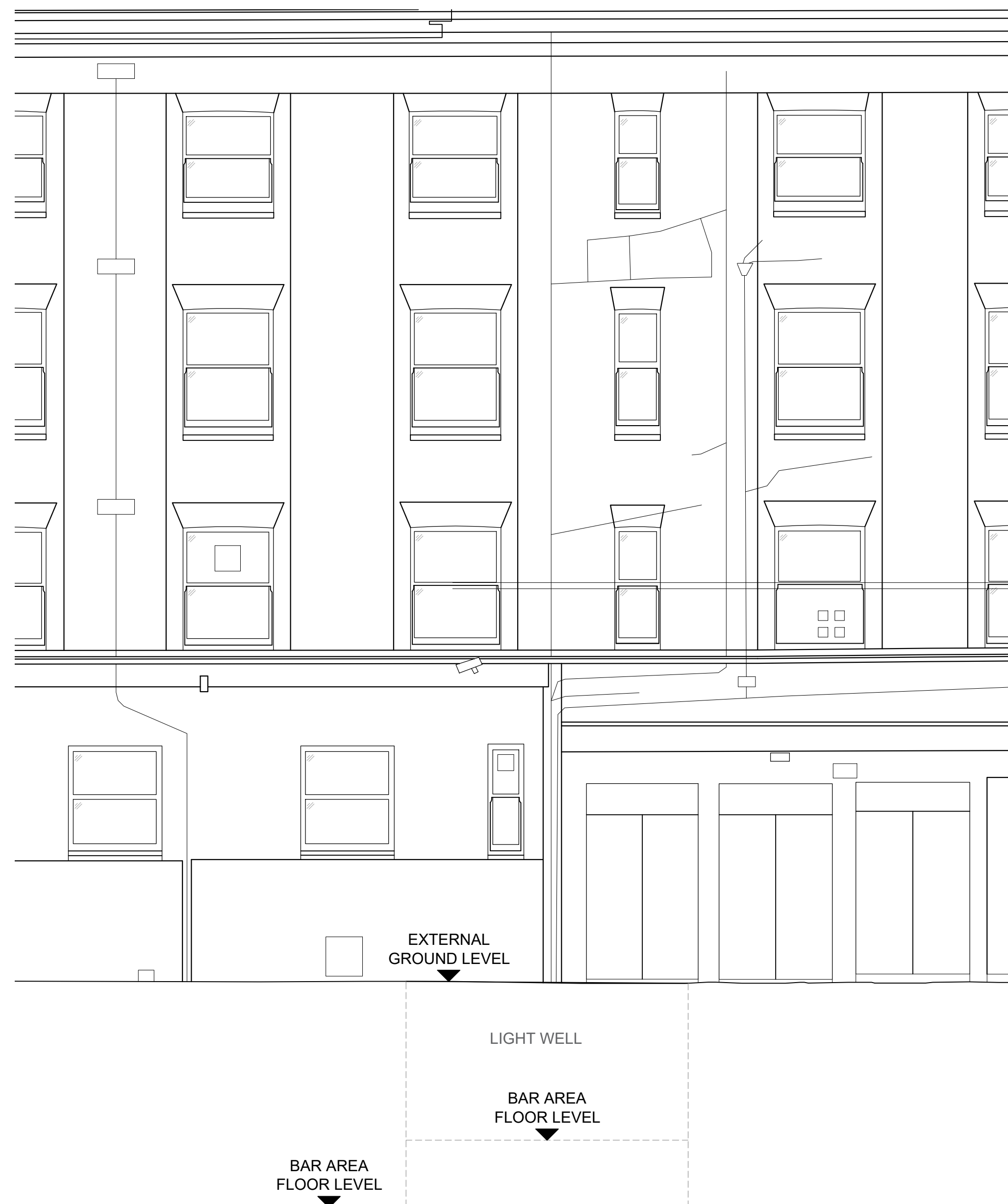
EXISTING PART ELEVATION A 1:50