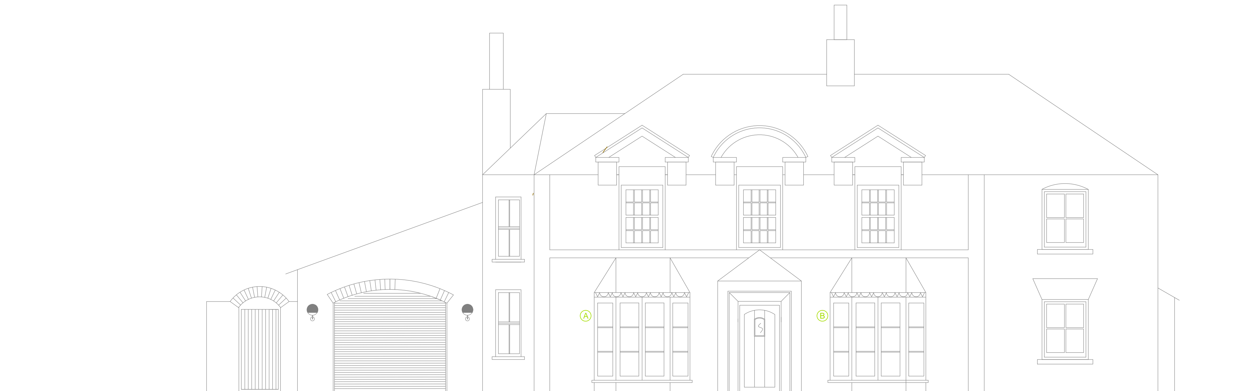
FRONT ELEVATION AS EXISTING AND AS PROPOSED