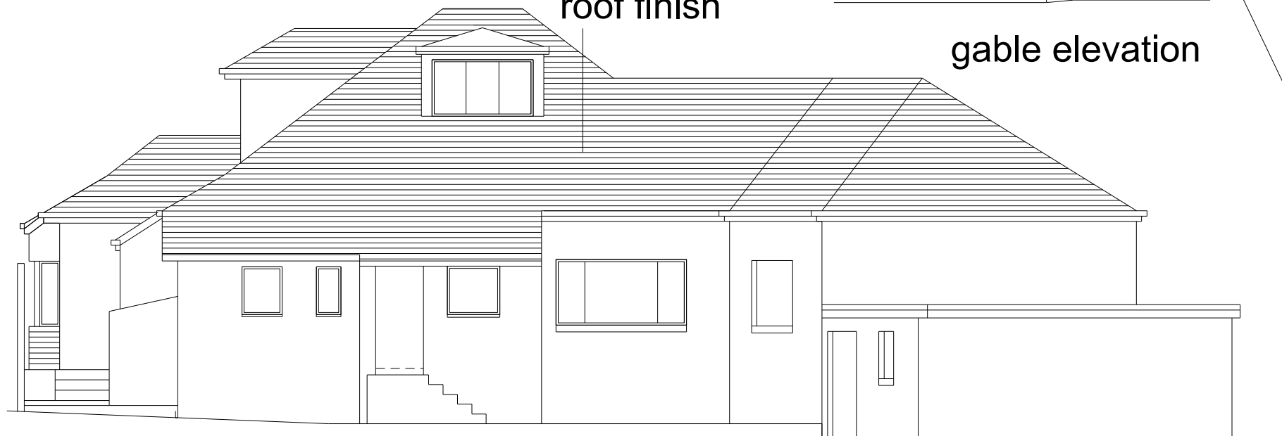
rear elevation existing

UPVC french doors to existing decked area