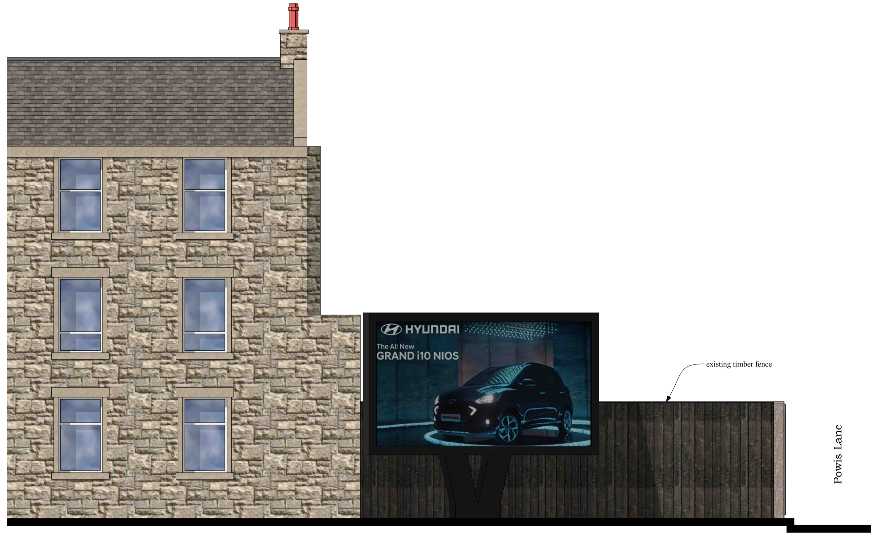
North East Elevation (Powis Place). 1:50.