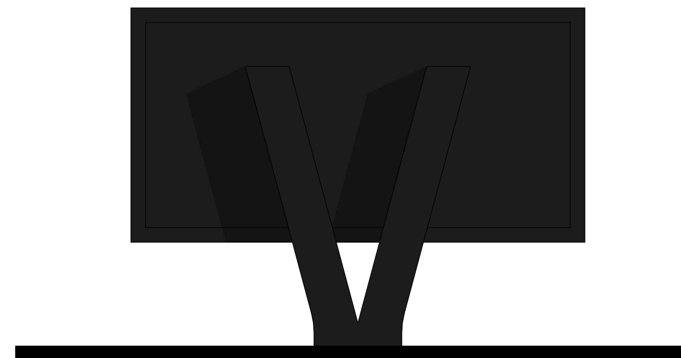
South Elevation. 1:50.