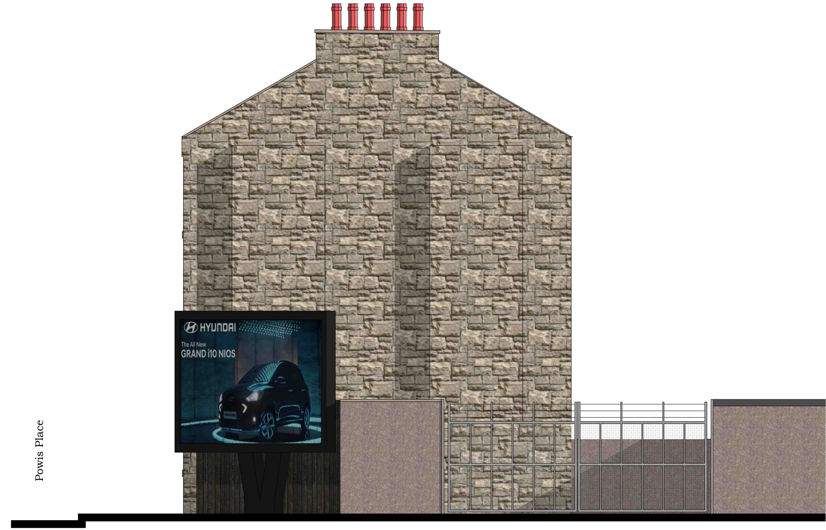
North West Elevation (Powis Lane). 1:50.