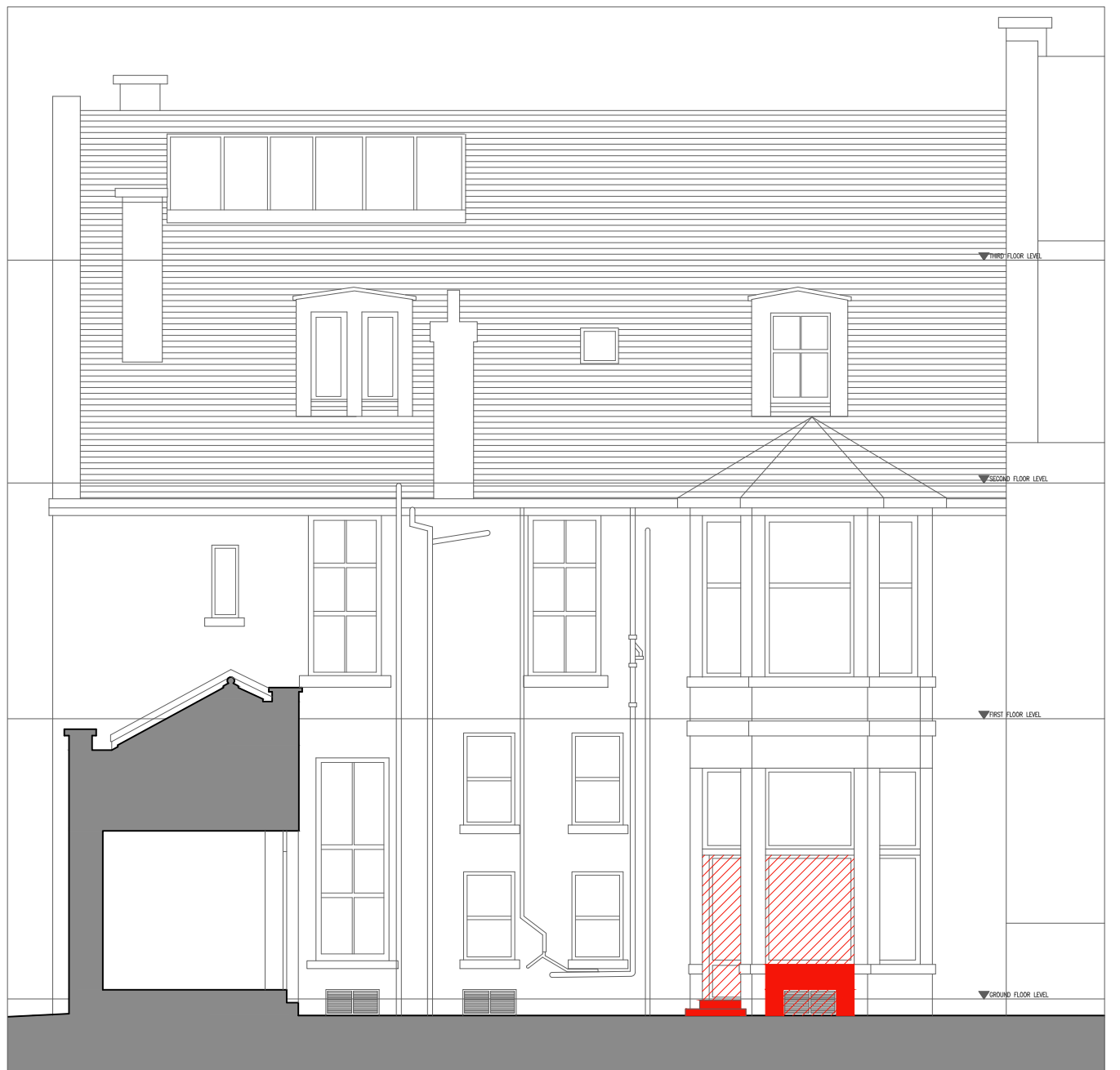
EXISTING REAR ELEVATION (cut through rear kitchen) SCALE 1:100