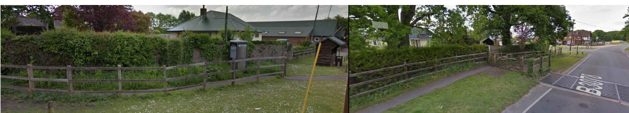
A) Willow cottage garden boundary currently hazel hurdle and overgrown shrubs