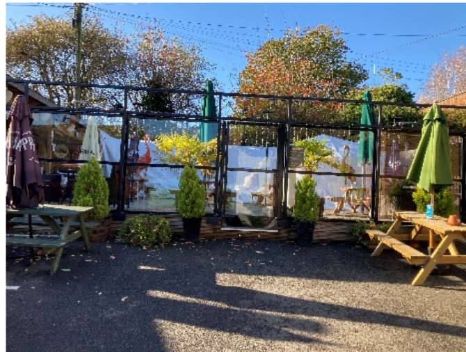
Existing Rear Terrace/ Outside Seating Area (Shown Without Roof Covering)