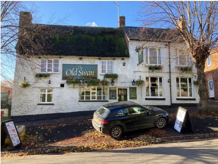
General View – Front Elevation (from The Square)

8 The Square, Earls Barton, Northampton NN6 0NA