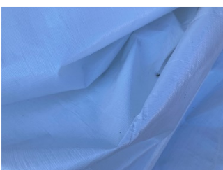
Proposed Temporary (Readily Removable) Fabric Roof Covering (on Hook and Eye Fastenings) to Existing Rear Terrace Area