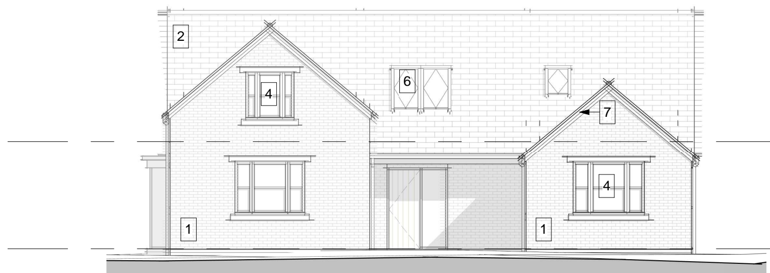
East Elevation 1 : 100