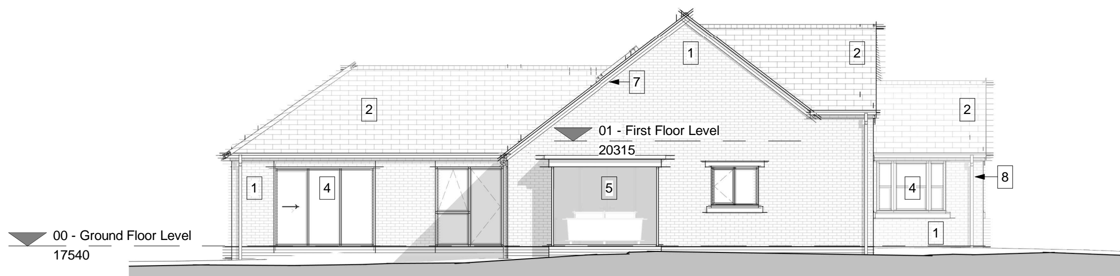
South Elevation 1 : 100