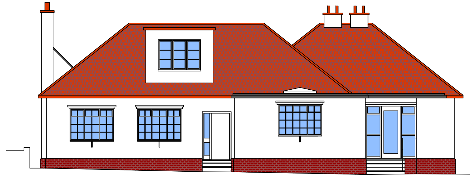
Proposed West Elevation 1:100