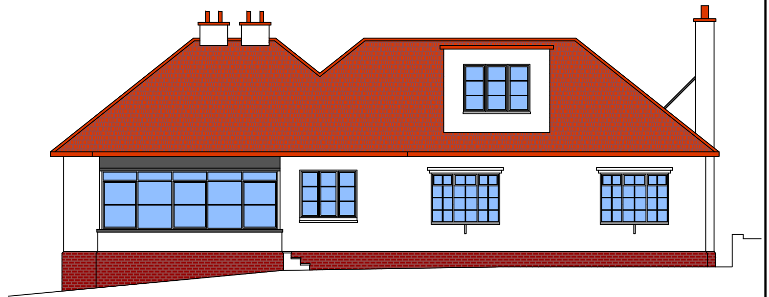
Proposed East Elevation 1:100