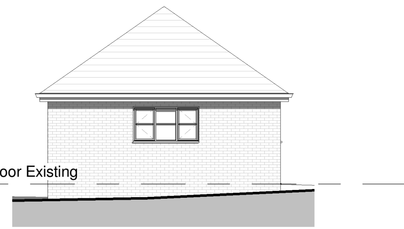
Side Elevation Existing 1 : 100