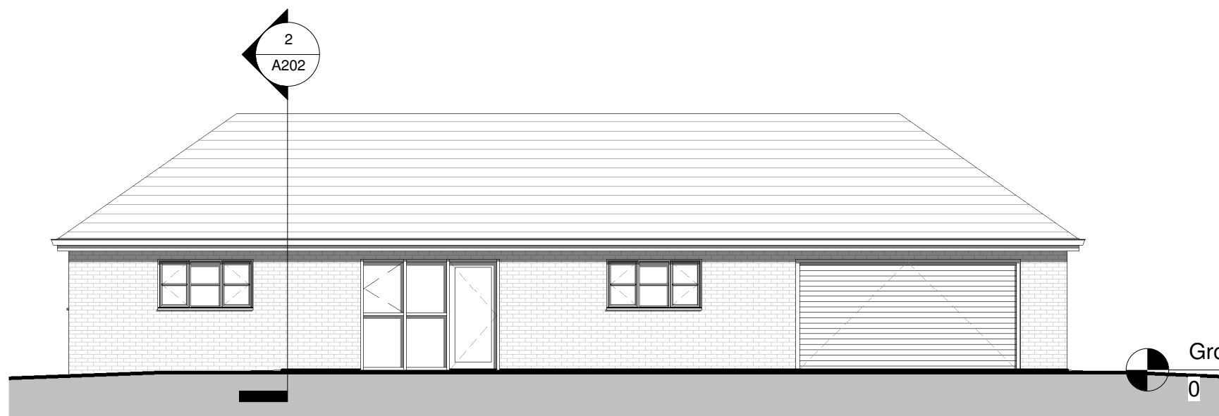
Front Elevation Proposed 1 : 100