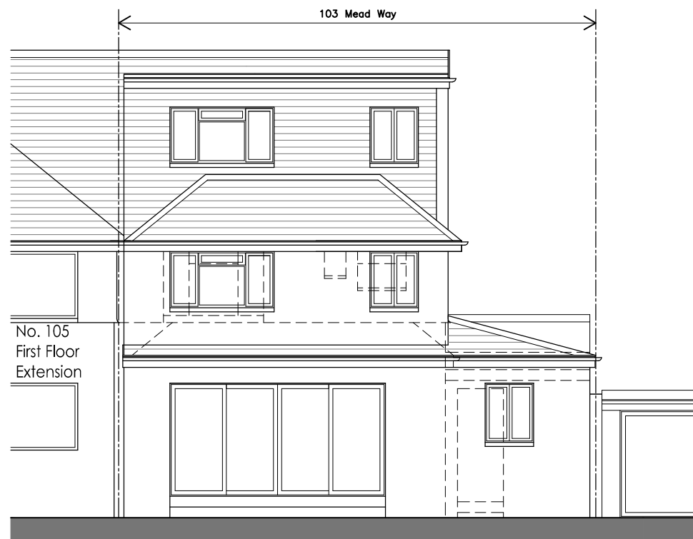
PROPOSED NORTH WEST ELEVATION SCALE 1:100