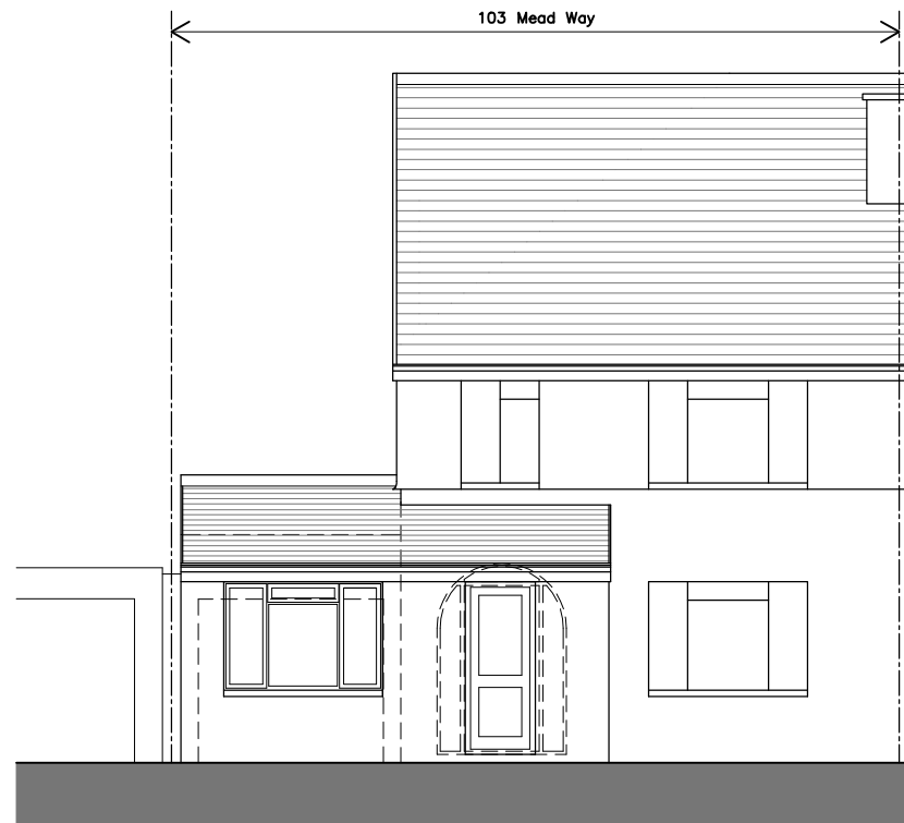
PROPOSED SOUTH EAST ELEVATION SCALE 1:100