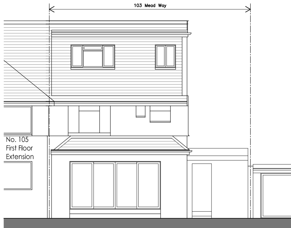
EXISTING NORTH WEST ELEVATION SCALE 1:100